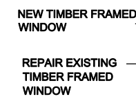
FRONT ELEVATION- PROPOSED ELEVATION B