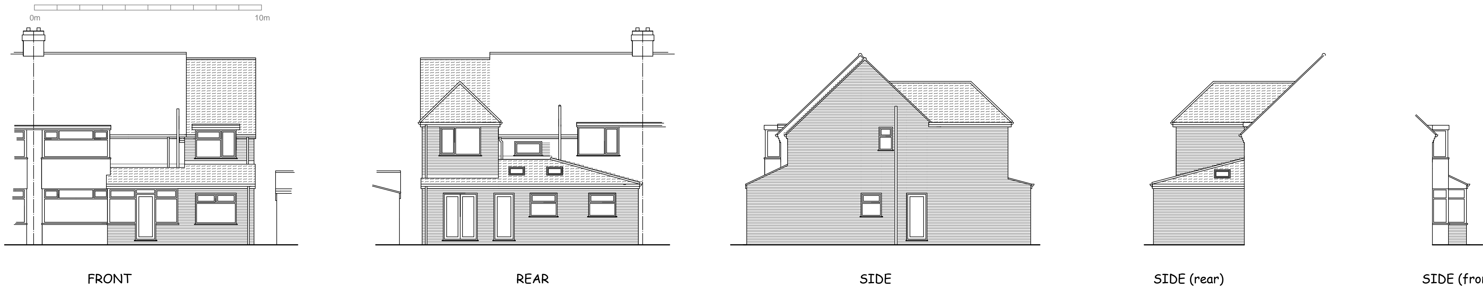
PROPOSED ELEVATIONS Scale 1:100