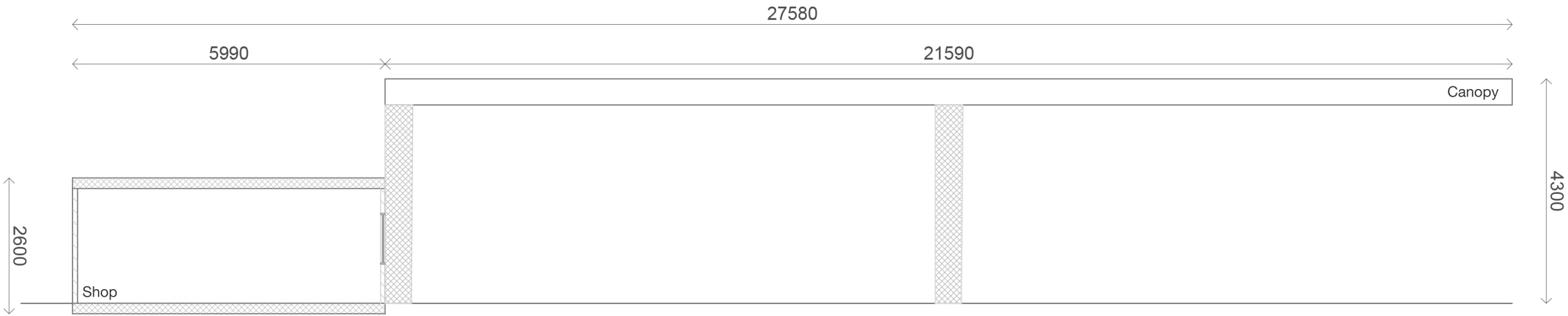
View Position Plan (NTS)

22 Berghem Mews Blythe Road London W14 0HN www.wildstone.co.uk 020 7313 9571