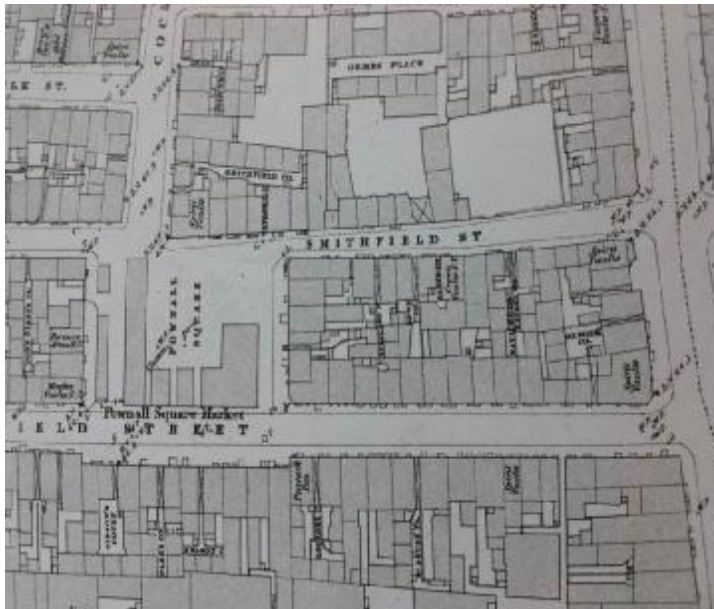
Figure 2*Street map dated 1860. Shenanigans can be seen on the corner of Smithfield Street named 'Spirit Vaults'.

Shenanigans is situated on Tithebarn Street and the corner of Smithfield Street, which is one of the original 'seven streets' of Liverpool. Directly opposite the pub building was the historic location of the Original Tithe Barn from which the streets derives its name.