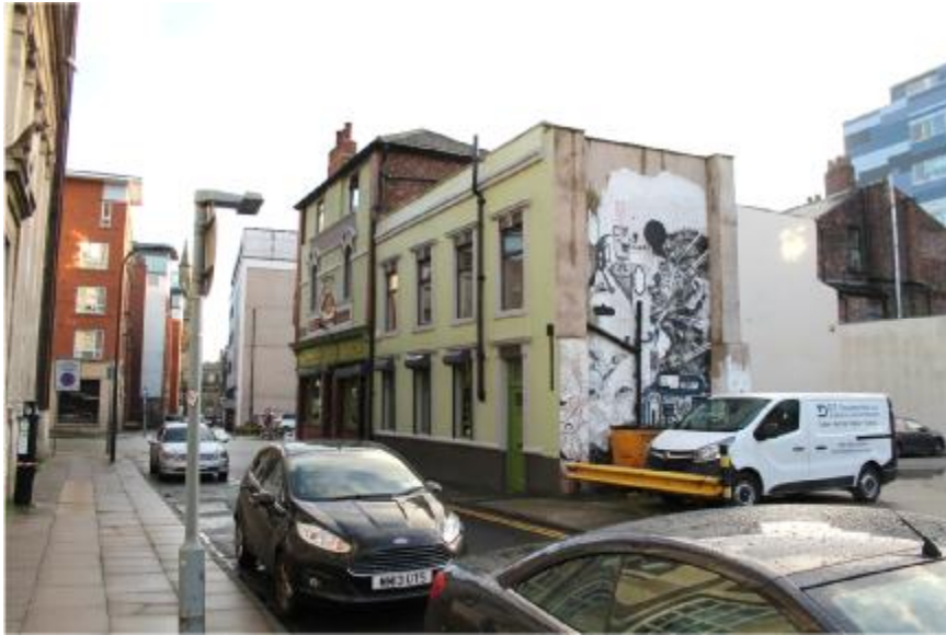
Figure 5 Existing rear of Shenanigans showing reduced height outrigger