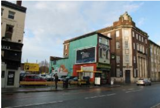
Figure 3 Gap between pubs

Around the time that the Tithe Barn was disappearing, pubs, spirit or beer vaults as they were also called, became a common sight; appearing every 100 metres (or 20 rods as was known back then). In 1842 there were 18 licensed premises on Tithebarn Street although most were un-named due to the huge quantity that there were. The first date we have found of a pub on Shenanigans site is 1841, as this is the first year of official licensing records. The earliest name we found being 'The Revolving Lamp' in 1894, when William Tyson was the