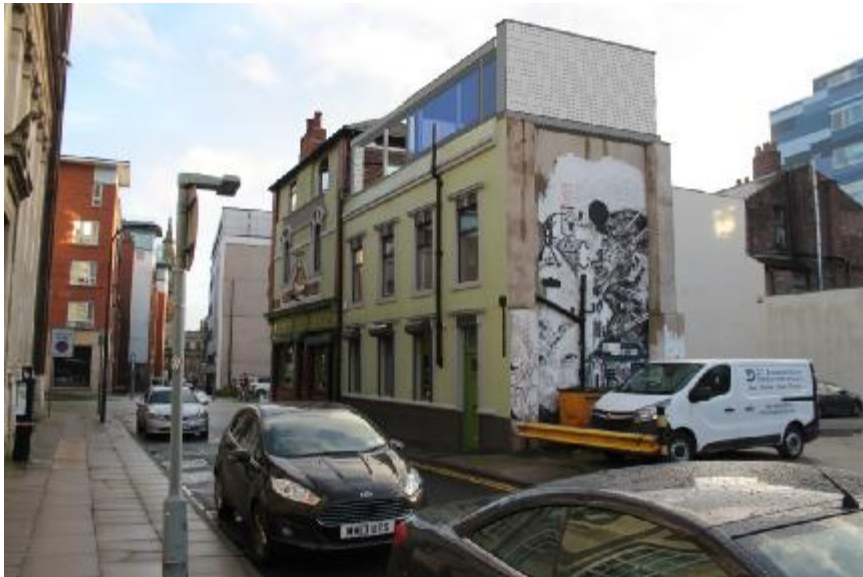
Figure 6 New proposal sits comfortably on rear block