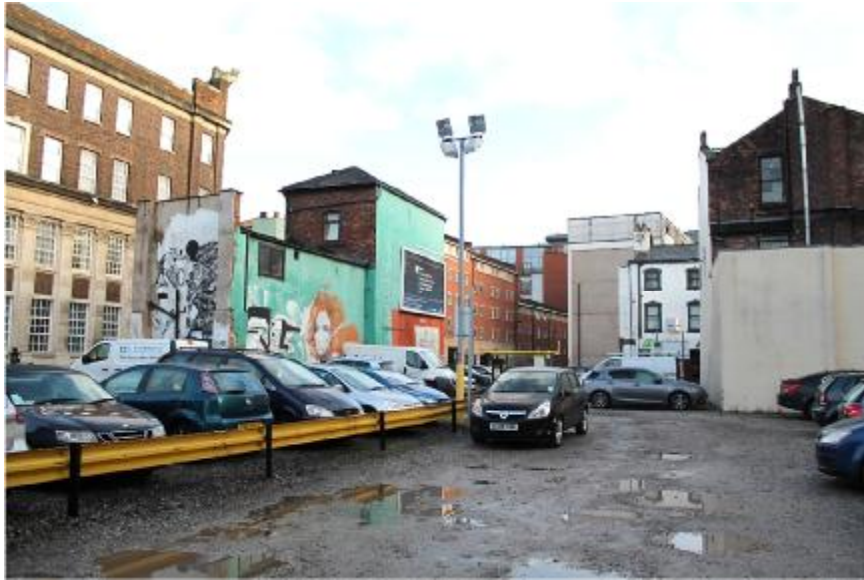
Figure 7 View of existing building from center of car park