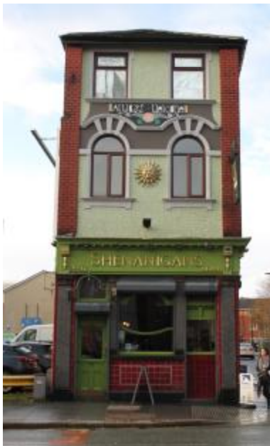
Figure 1 Shenanigans stands alone

The design proposal was submitted to planning for a pre-application enquiry which was validated on 8 th March 2016 Ref. 0117/16. The planning officer dealing with the case was Chris Ridland was generally in support of the proposal. He did however raise the issue of reducing or obscuring the glazing on the west elevation so as not to prejudice the development of the adjacent site. We have considered this and proposed the glazing to this elevation will be left clear until such a time a development takes place. At that time obscure 'frosted' effect vinyl will be applied to the inner face of glass. We would point out that the sliding window frames will allow the glass to be cleaned using telescopic brushes without the need to access the adjoining land. We would clarify that there is a small variation to the roof design post the pre-application submission. Originally only a small square of the proposal was to be a roof terrace. Our client has decided that the new roof will slide back to allow for a larger terrace area (approx. 45% of roof). The two side windows also slide back at the same time. This design gives greater control to the opening up of the roof and it can be closed at a given time