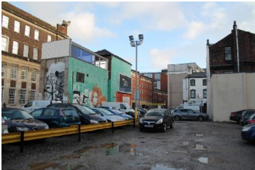
Figure 8 Proposed roof extension