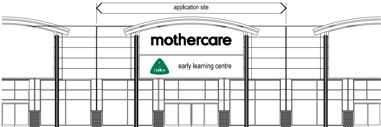
Existing Front elevation (Mid terrace) 1:100 @ A1

(No external modification to front elevation under proposed works).