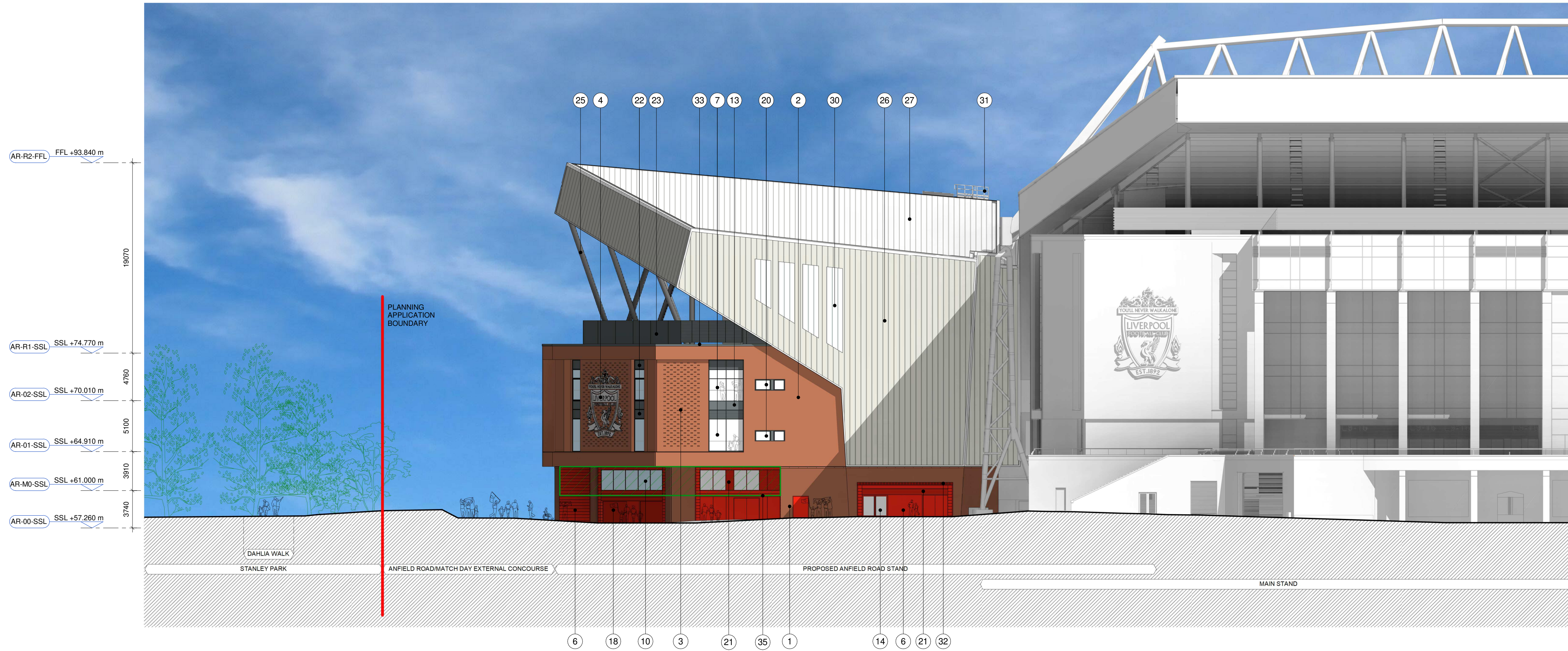
1 PROPOSED NORTH-WEST ELEVATION 1 : 250

NOTE: FOR ALL LANDSCAPE PROPOSALS REFER TO LANDSCAPE ARCHITECTS DRAWINGS