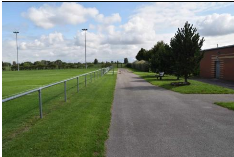
Figure 5. Existing pitch to the left with changing facilities to the right.