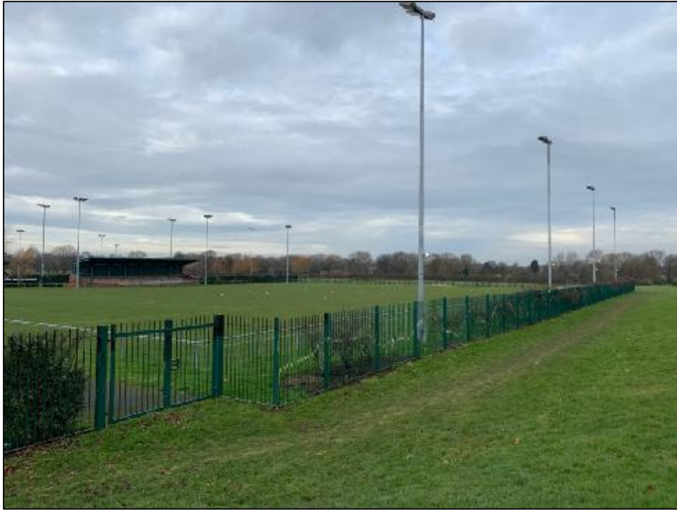
Figure 4. View of pitch from grass bank in the park.