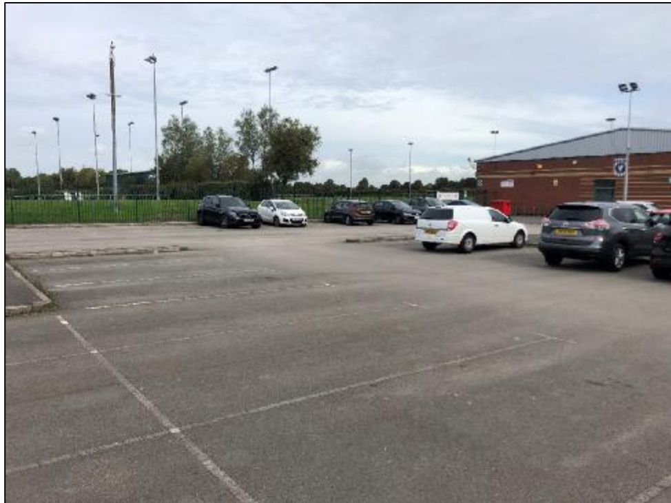
Figure 3. View from the existing car park.