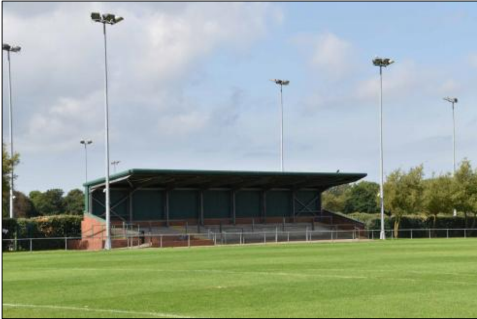
Figure 2. Existing Covered Terrace