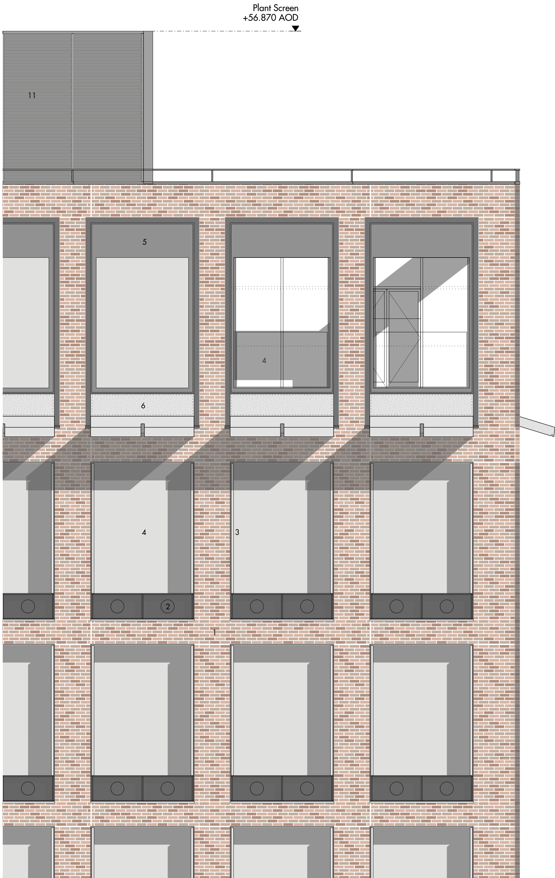
01 ELEVATION - BAY STUDY TERRACE Scale 1:50