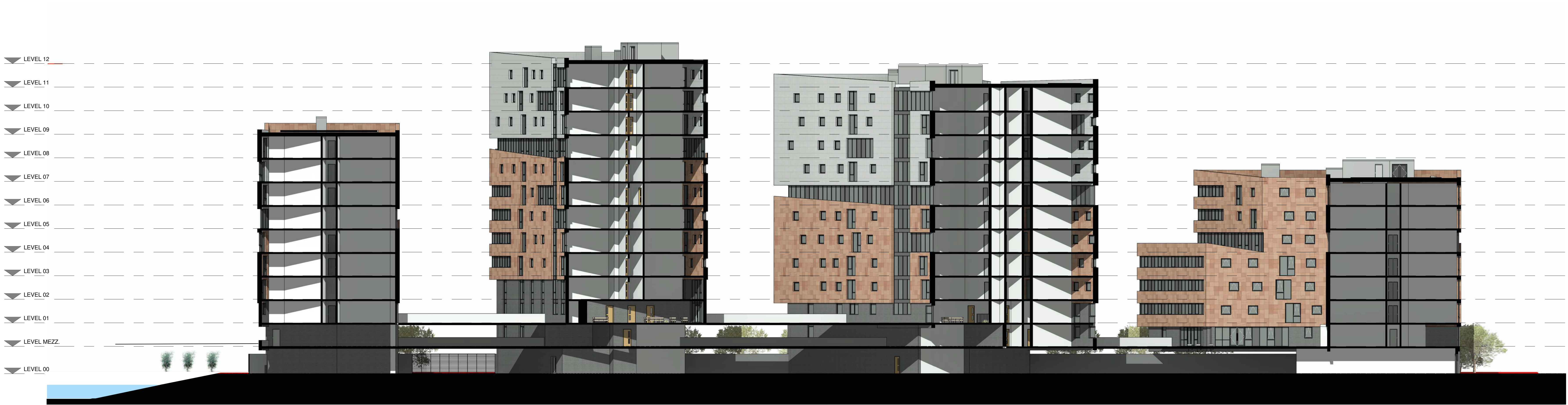
Long Site Section 1 : 200

This drawing is the property of Fletcher-Rae (UK) Limited (t/a Fletcher-Rae) and copyright is reserved by them. The drawing is not to be copied or disclosed by or to any unauthorised persons without the prior written consent of Fletcher-Rae (UK) Limited.