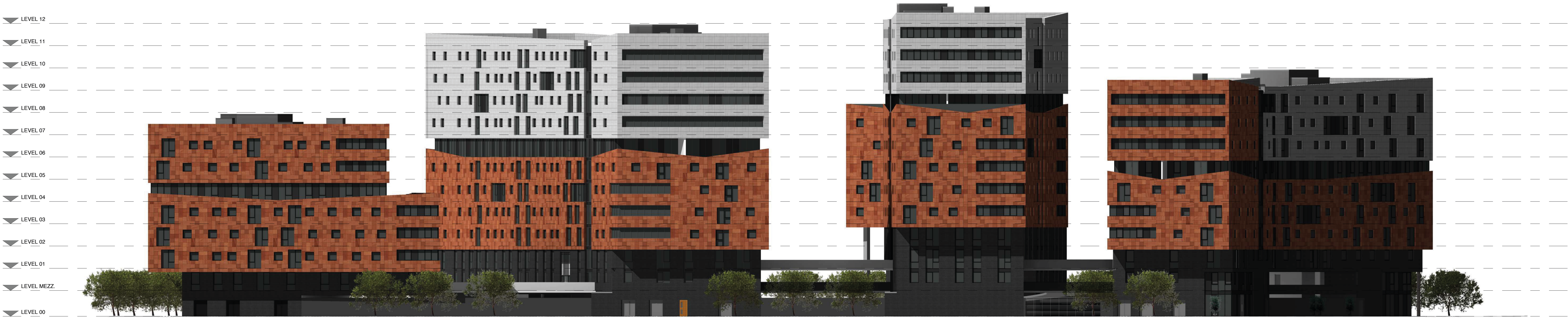
EAST ELEVATION 1 : 200

This drawing is the property of Fletcher-Rae (UK) Limited (t/a Fletcher-Rae) and copyright is reserved by them. The drawing is not to be copied or disclosed by or to any unauthorised persons without the prior written consent of Fletcher-Rae (UK) Limited.