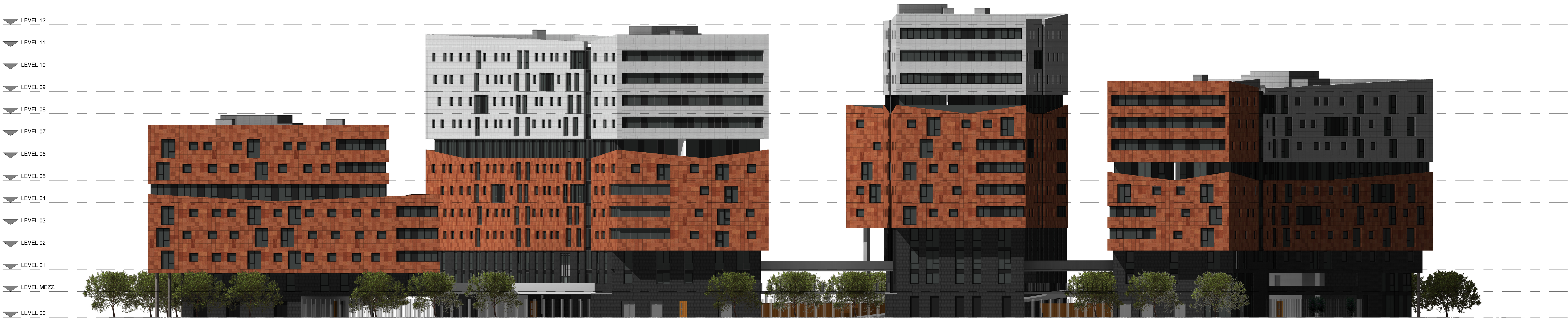
EAST ELEVATION 1:200

This drawing is the property of Fletcher-Rae (UK) Limited (t/a Fletcher-Rae) and copyright is reserved by them. The drawing is not to be copied or disclosed by or to any unauthorised persons without the prior written consent of Fletcher-Rae (UK) Limited.