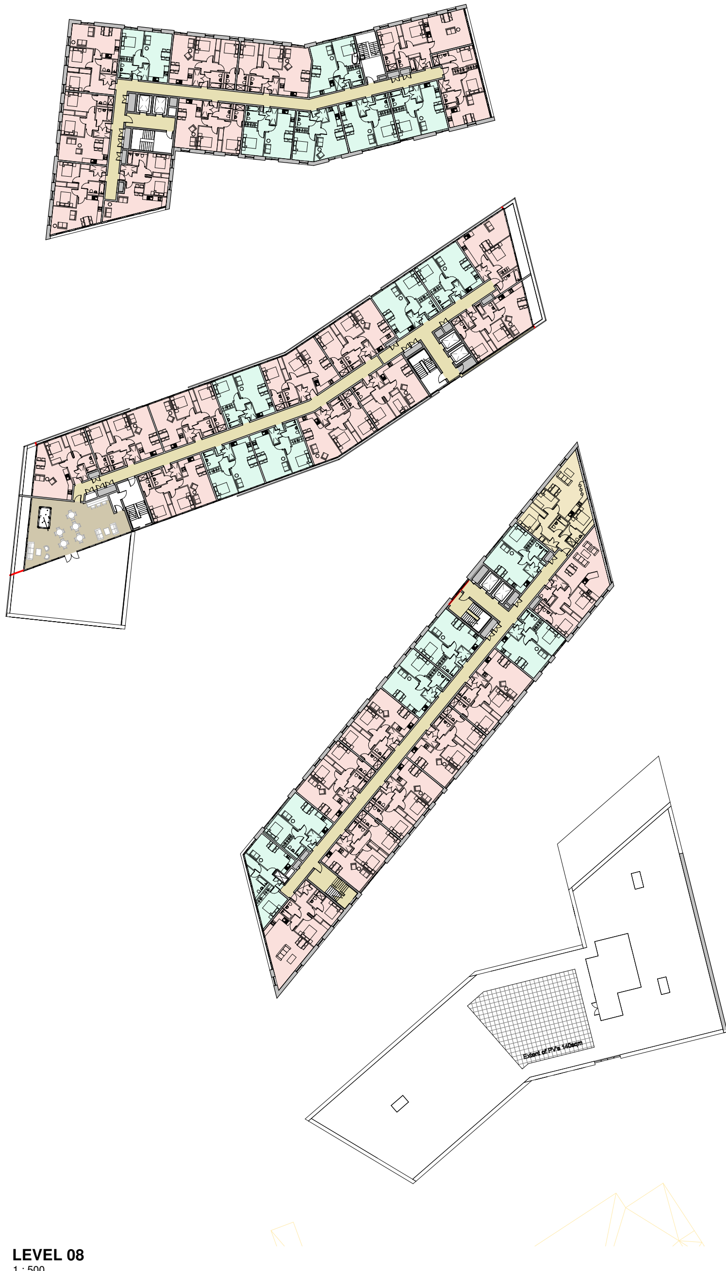
LEVEL 08 1 : 500