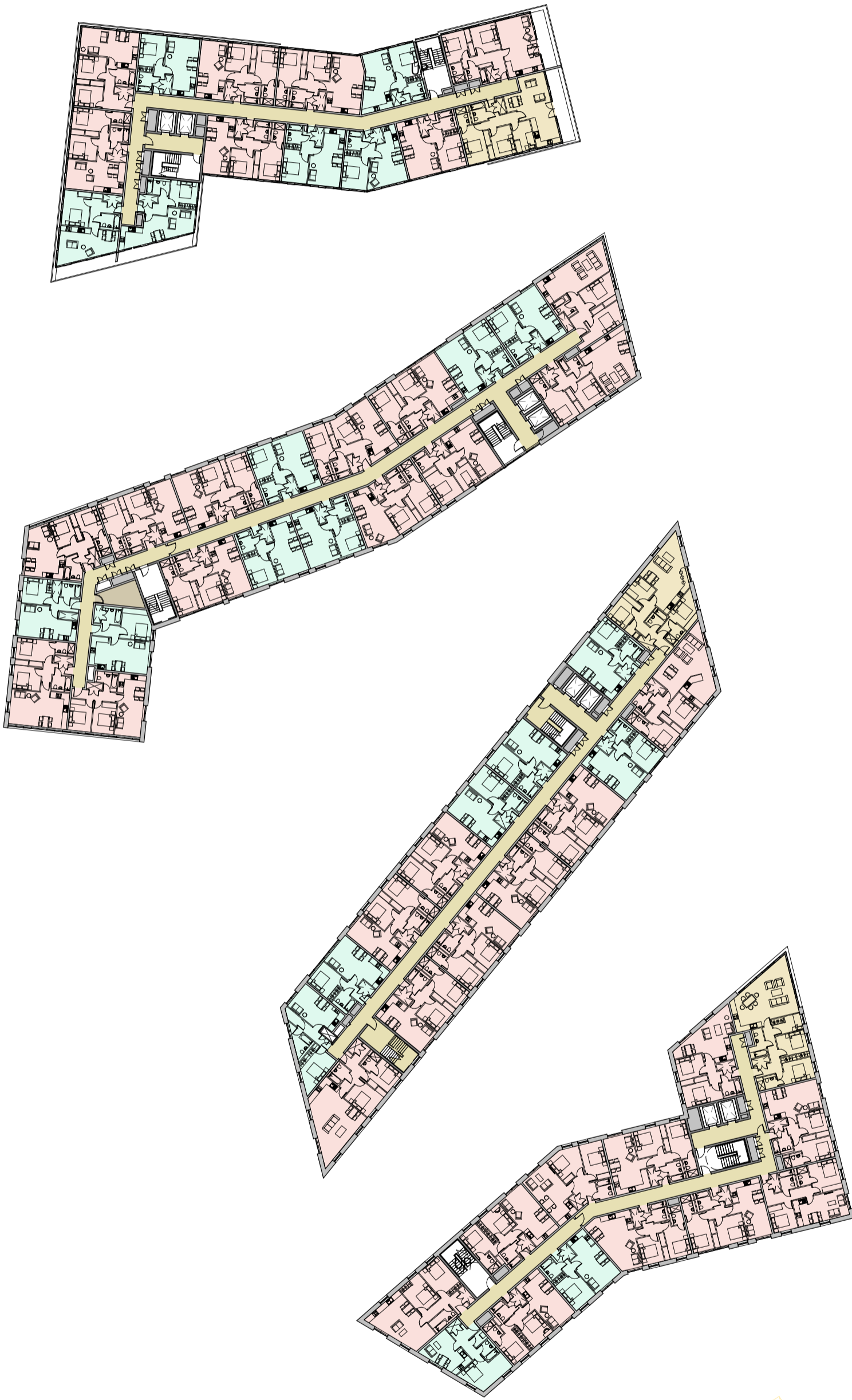
LEVEL 05 1 : 500