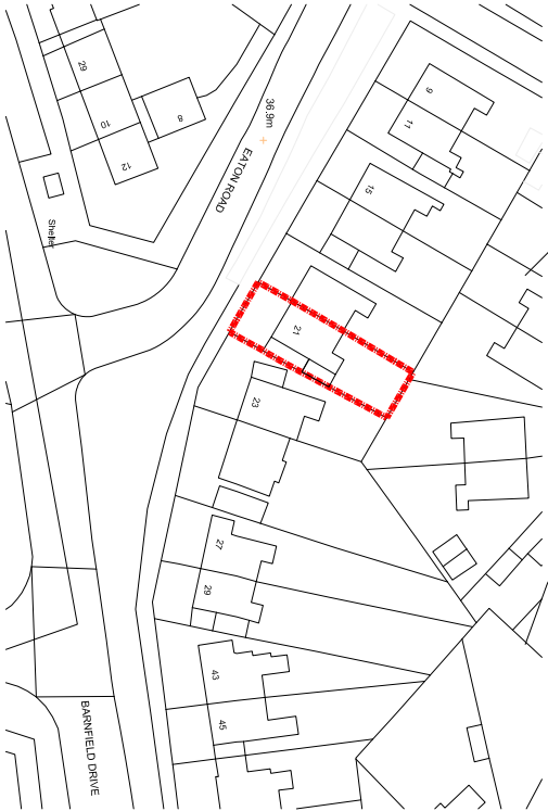
Location plan @ 1:1250