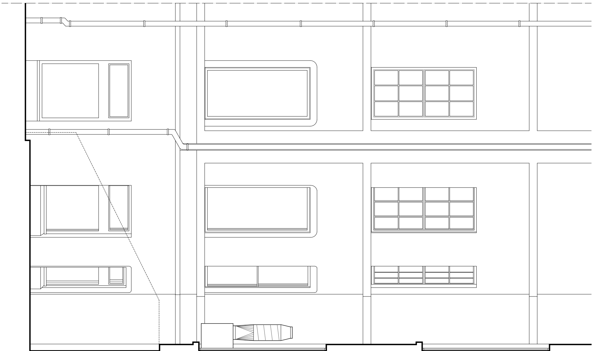
EXISTING ELEVATION B-B, SCALE 1:50