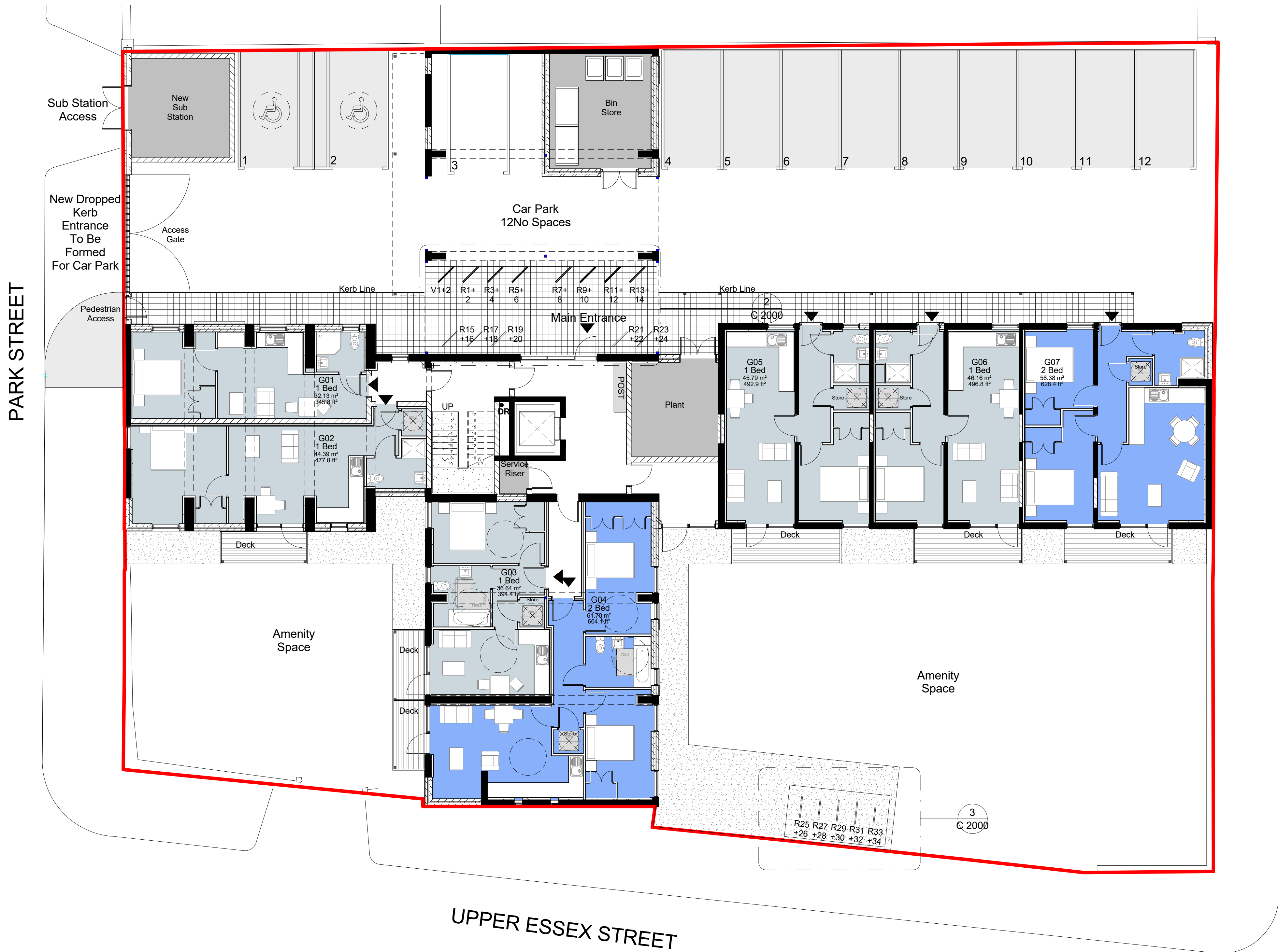
1 Proposed Ground Floor Plan 1 : 100