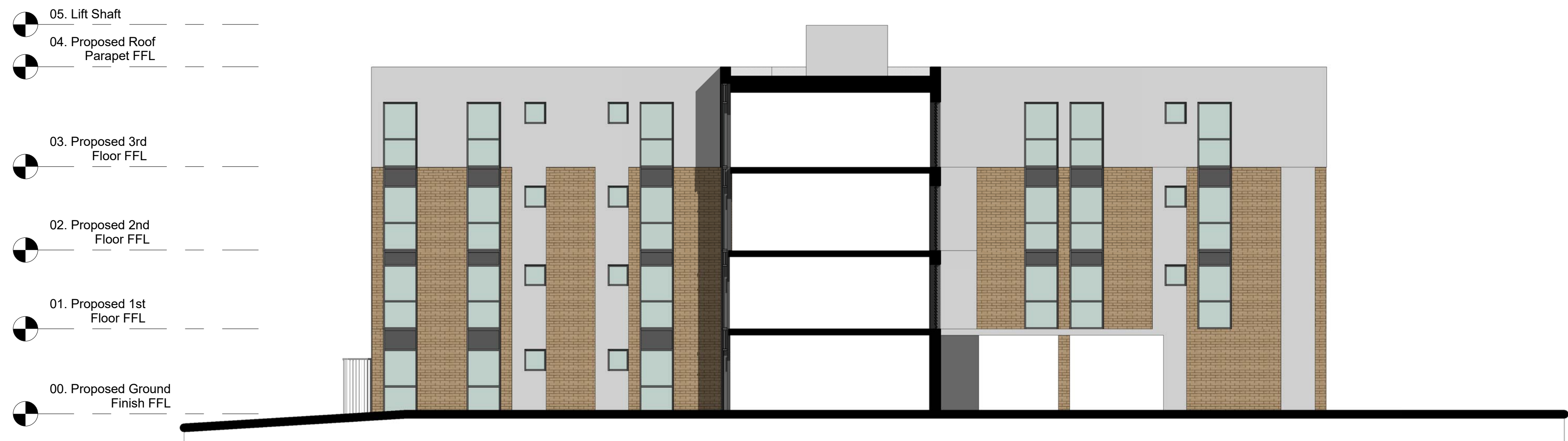
2 Proposed Section B-B 1 : 100