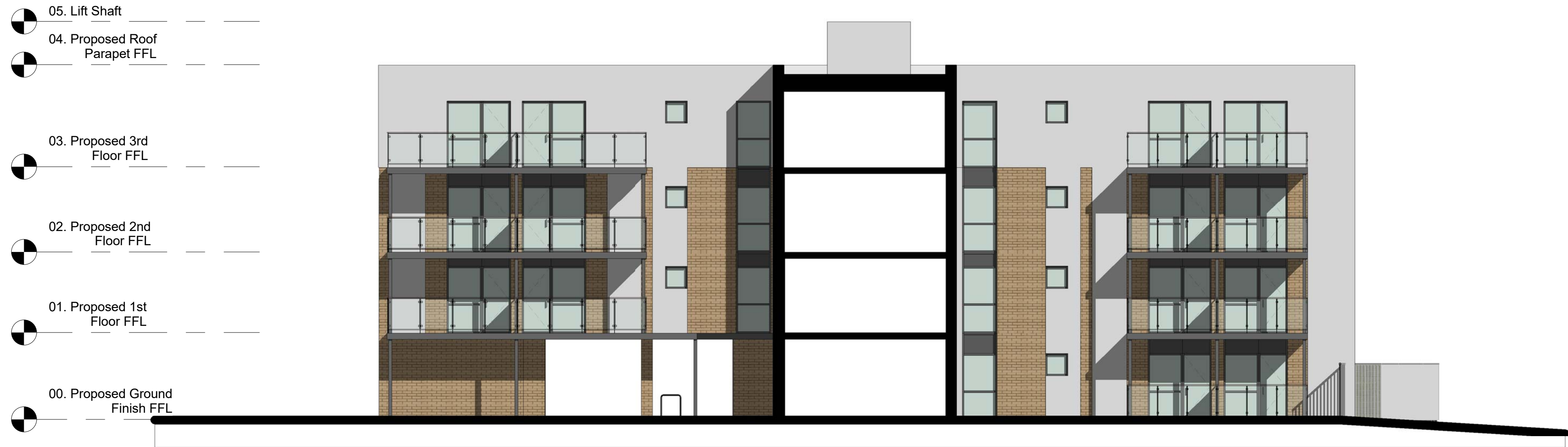
1 Proposed Section A-A 1 : 100

All dimensions shall be verified by the Contractor(s) on site prior to work commencing and relevant orders being placed. Do not scale from this drawing and only work to written dimensions. Any discrepancies to be brought to the attention of the Contract Administrator for instructions prior to proceeding.