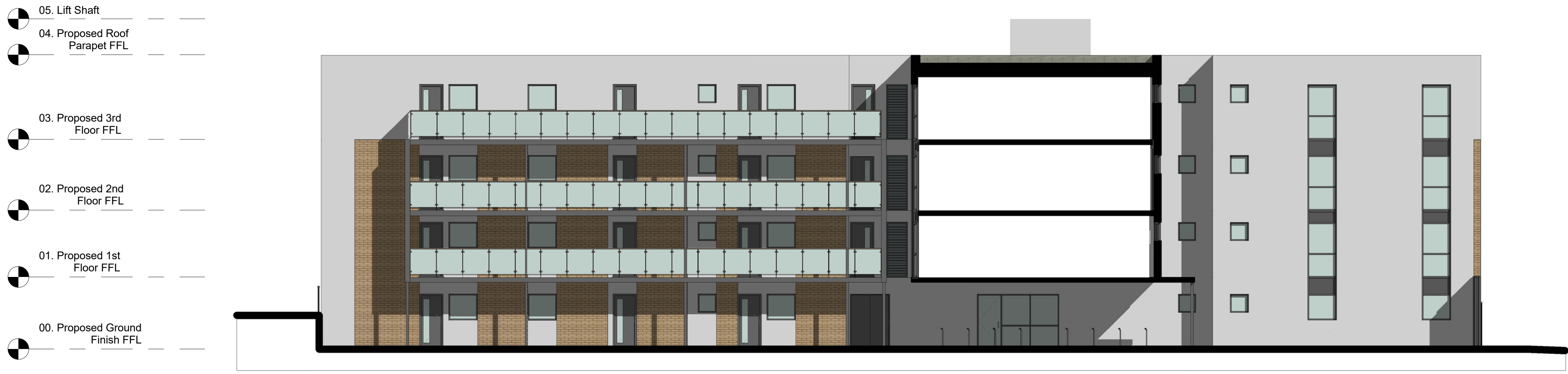
3 Proposed Section C-C 1 : 100