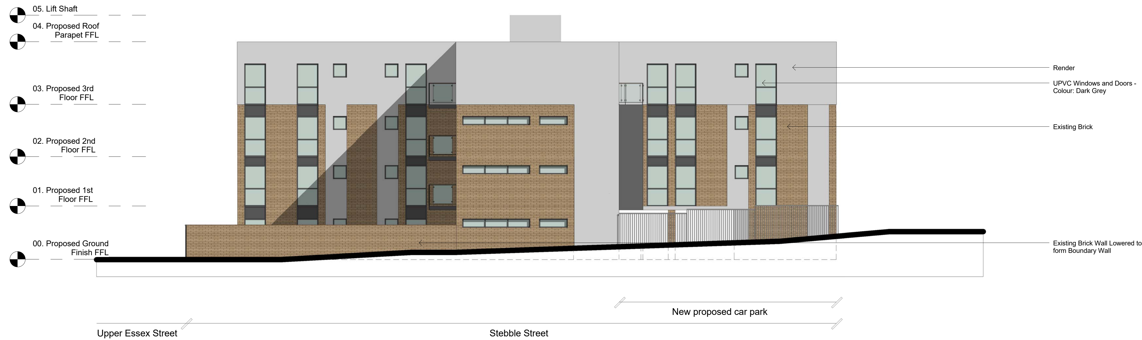
2 Steble Street Elevation - Proposed 1 : 100