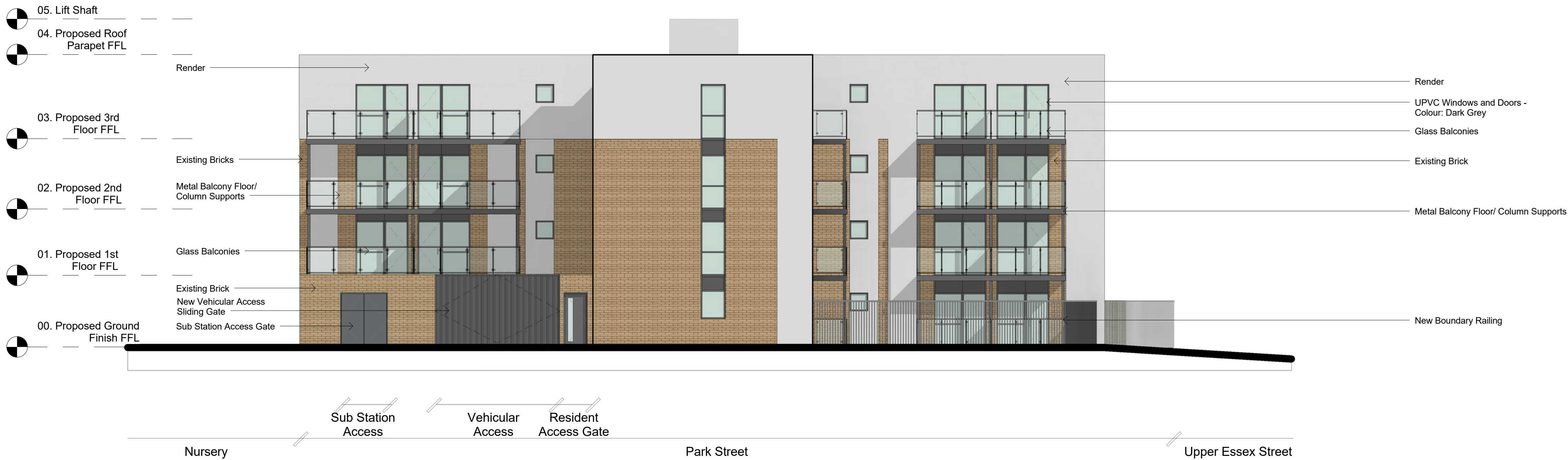
1 Park Street Elevation - Proposed 1 : 100