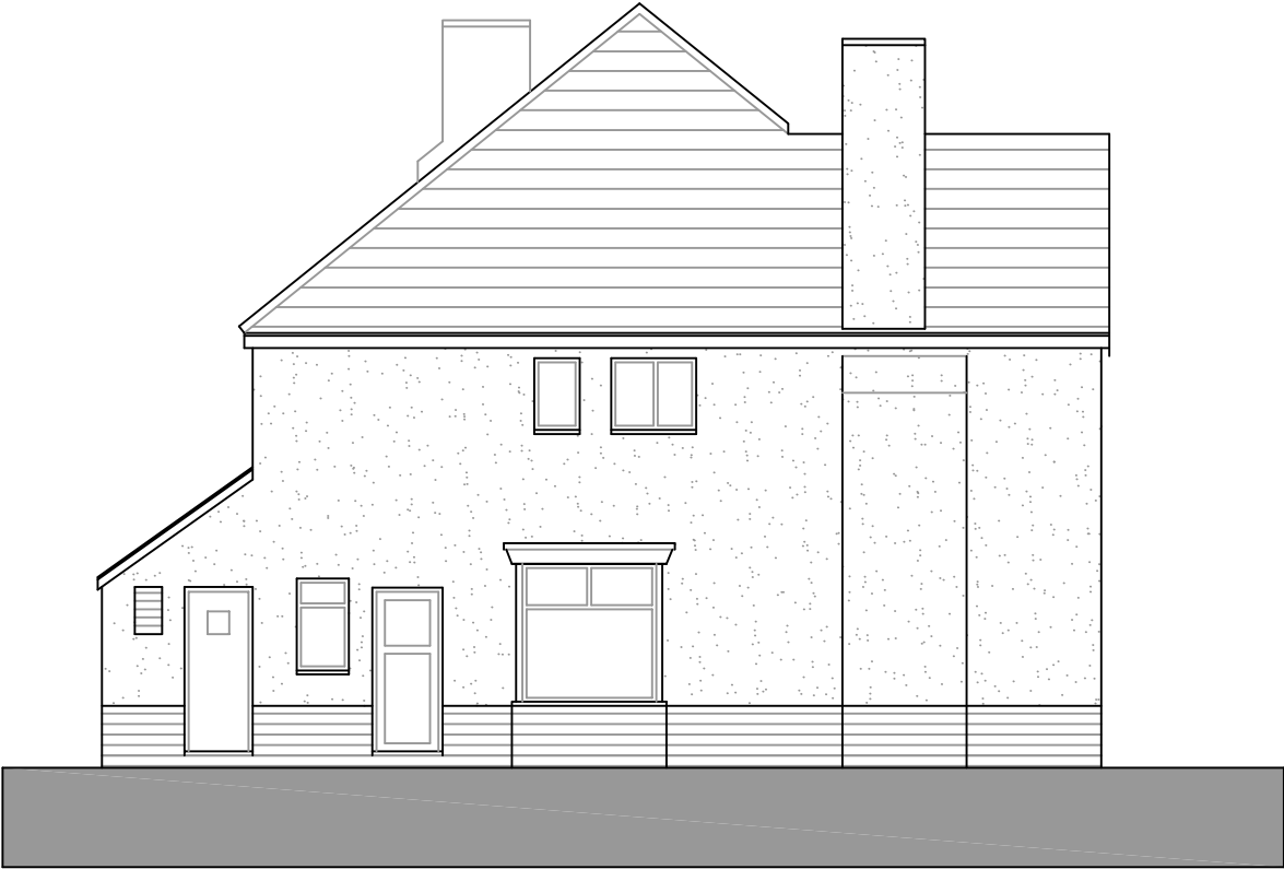
side elevation (garage and store omitted for clarity)