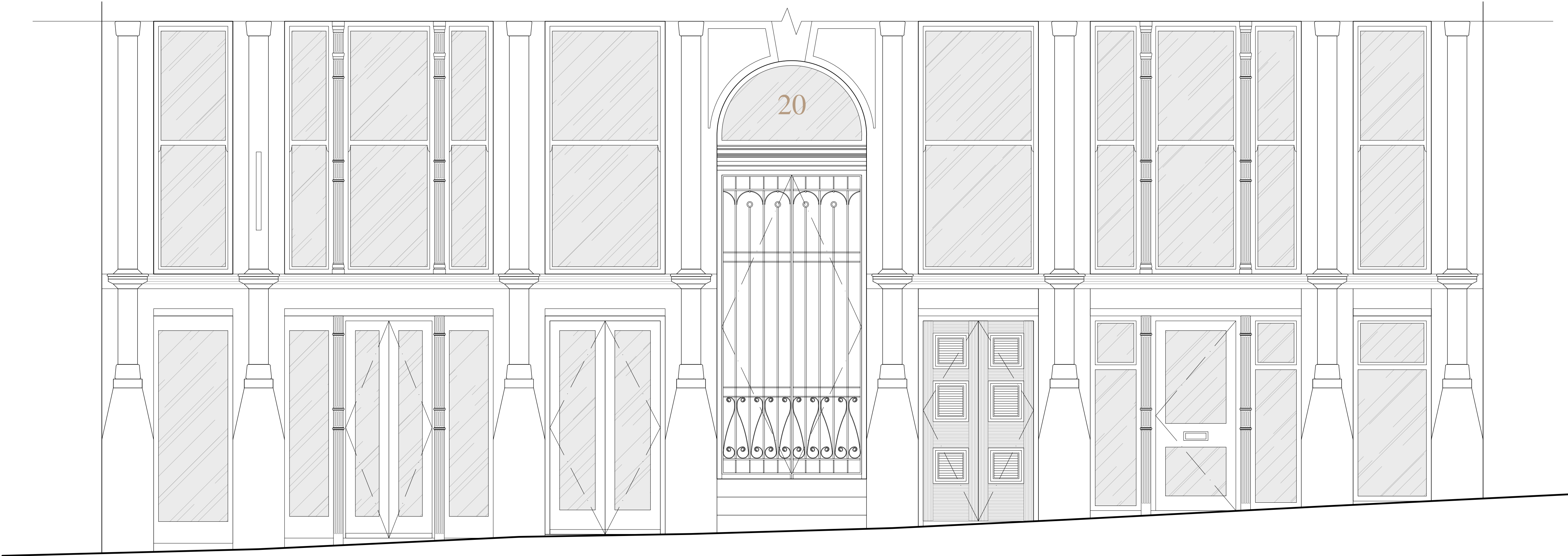
Existing Shopfront Elevation Scale: 1:25