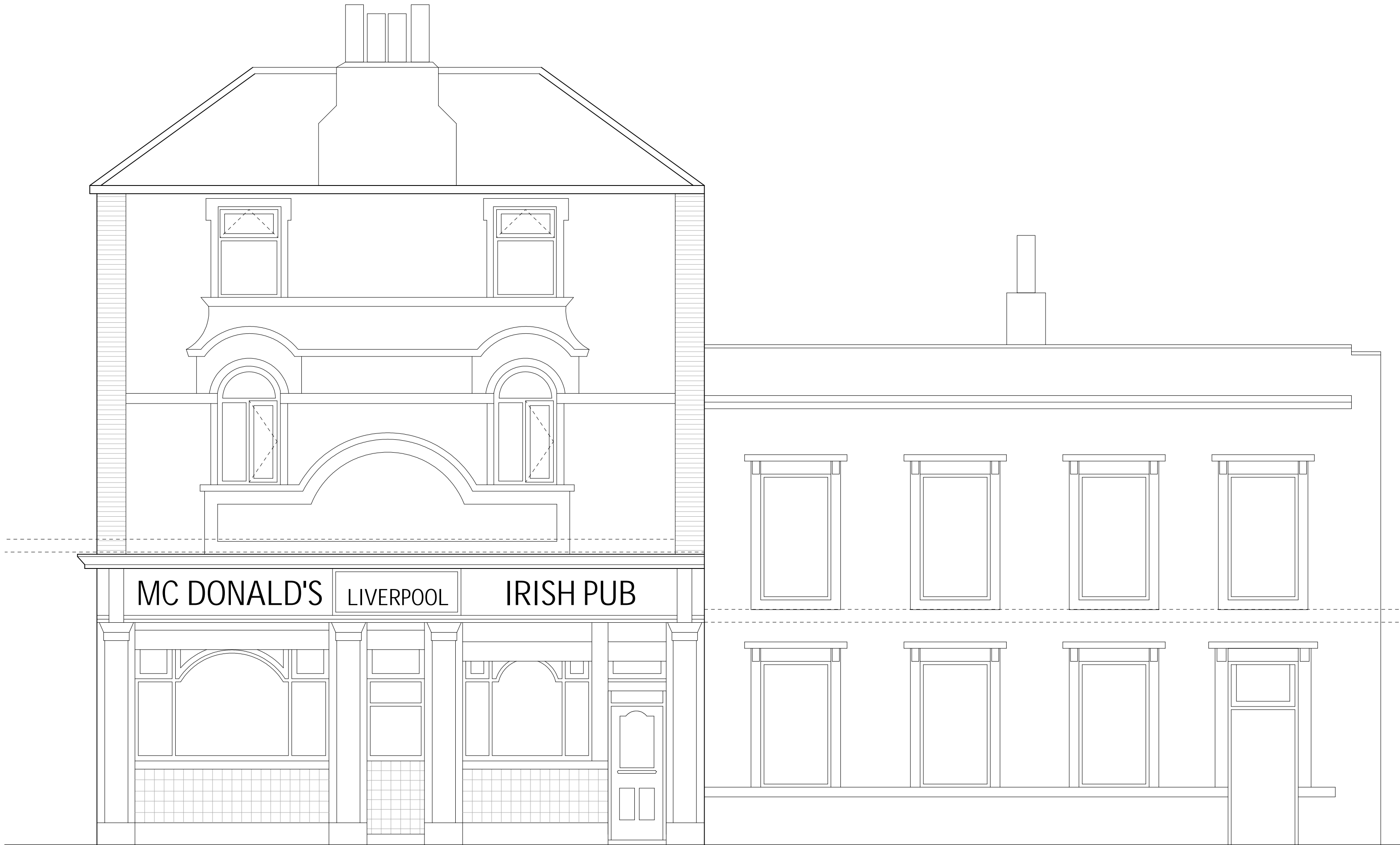
1 East Elevation 1:50 @ A1