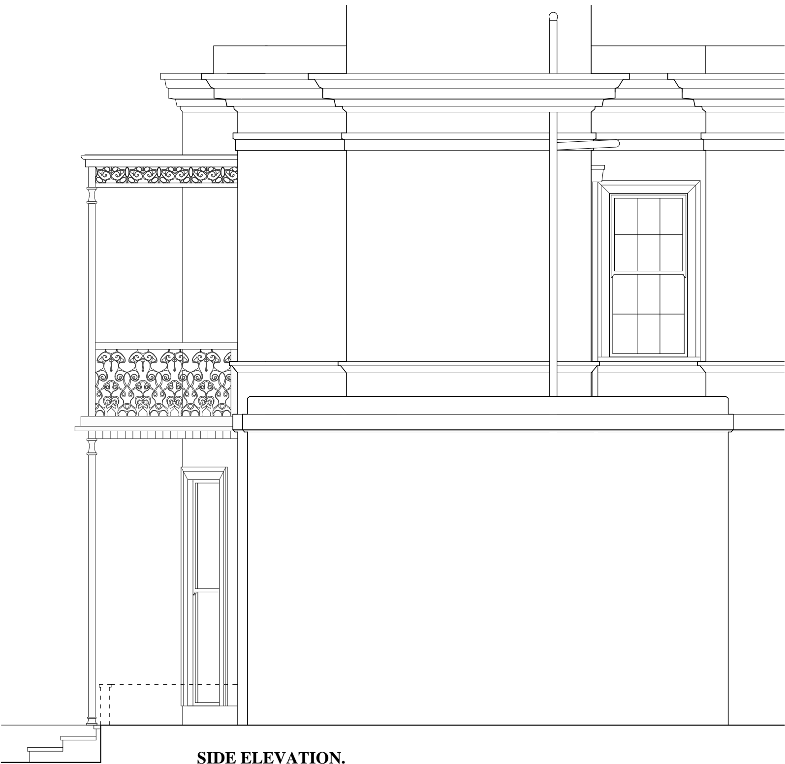
SIDE ELEVATION. PROPOSED 1/50