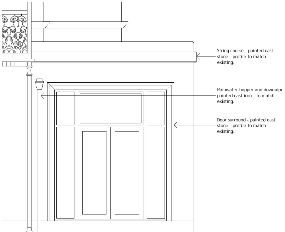
REAR ELEVATION. PROPOSED 1/50

EXTERNAL WALL FACING. Lime based render with exterior quality mineral based paint finish - colour(s) to match existing. DRESSINGS - STRING COURSE & DOOR SURROUNDS. Cast stone - profiles to match existing, with exterior quality mineral based paint finish - colour(s) to match existing. EXTERNAL DOORS & GLAZED SIDE PANELS. Double glazed, timber framed - profiles to match existing. Paint finish colour(s) to match existing. ROOF LANTERN. Double glazed timber framed. Paint finish colour(s) to match existing windows. RAINWATER GOODS. Cast iron. Paint finish colour(s) to match existing.