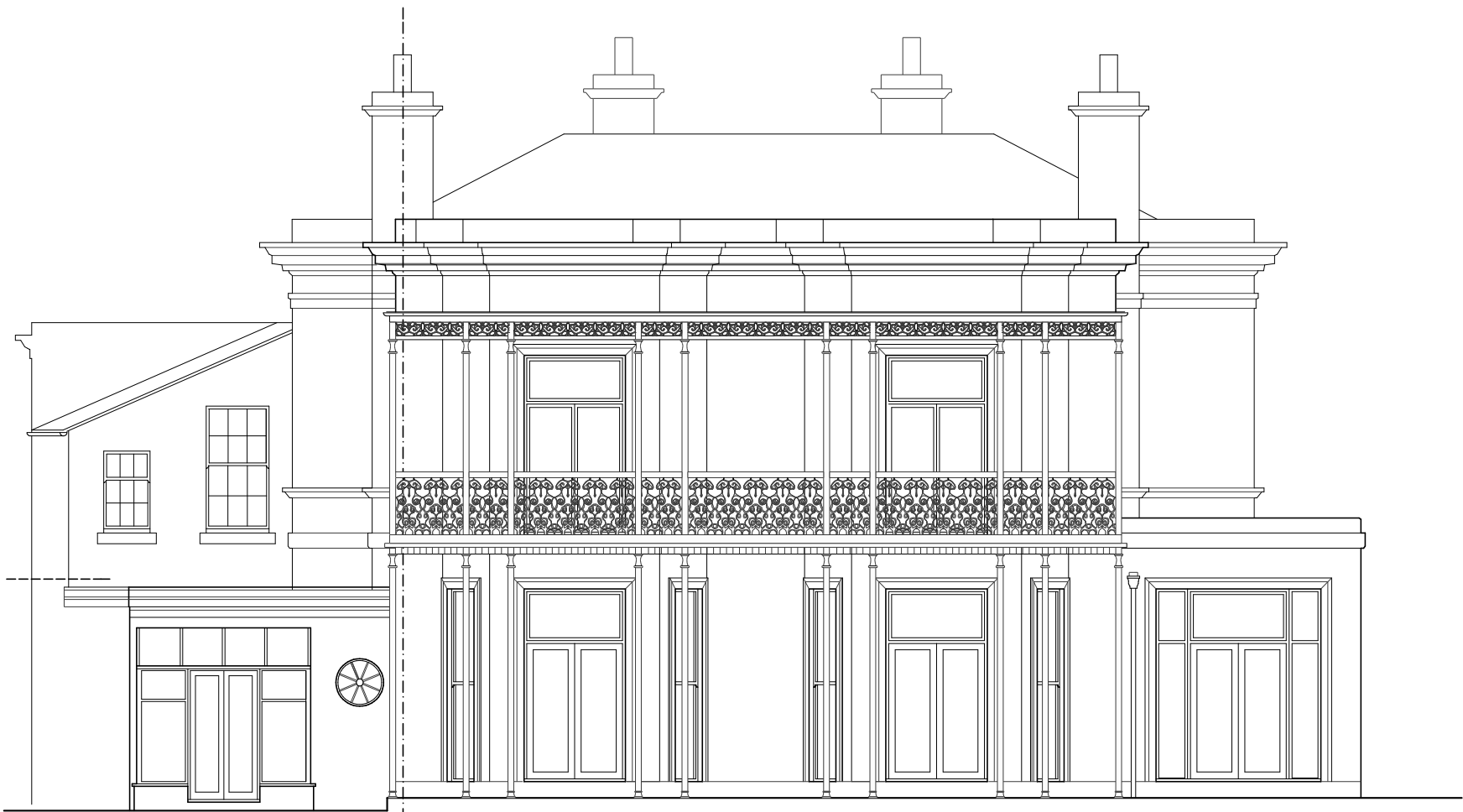
REAR ELEVATION. PROPOSED 1/100