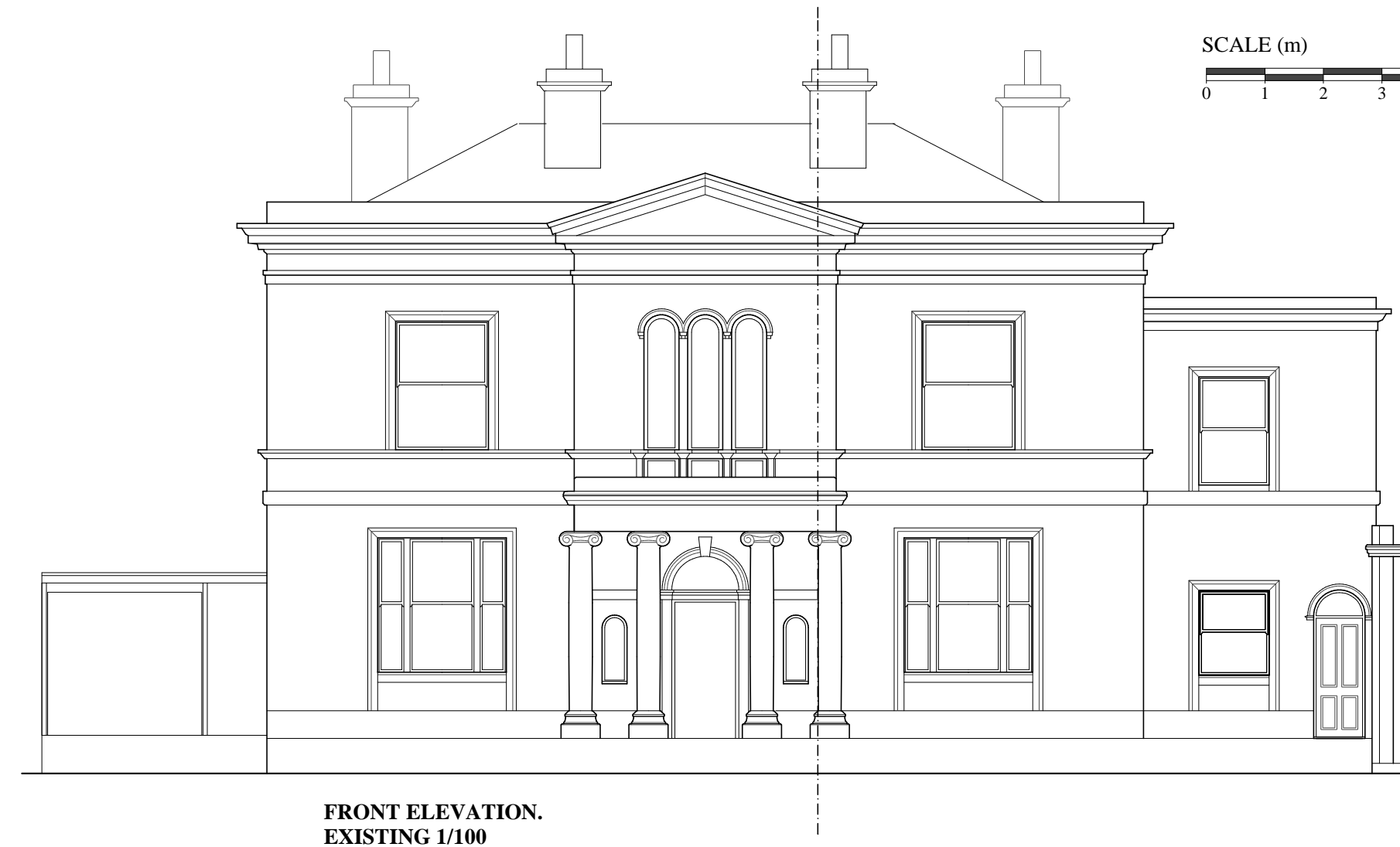
FRONT ELEVATION. EXISTING 1/100