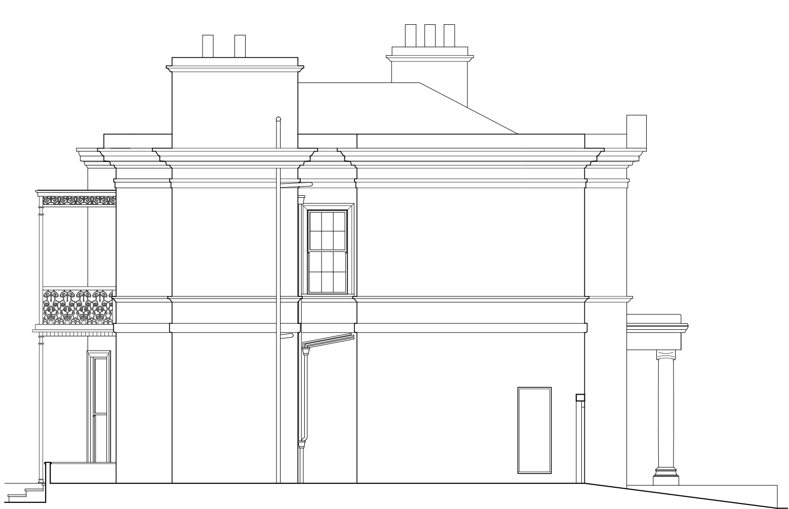
SIDE ELEVATION. EXISTING 1/100