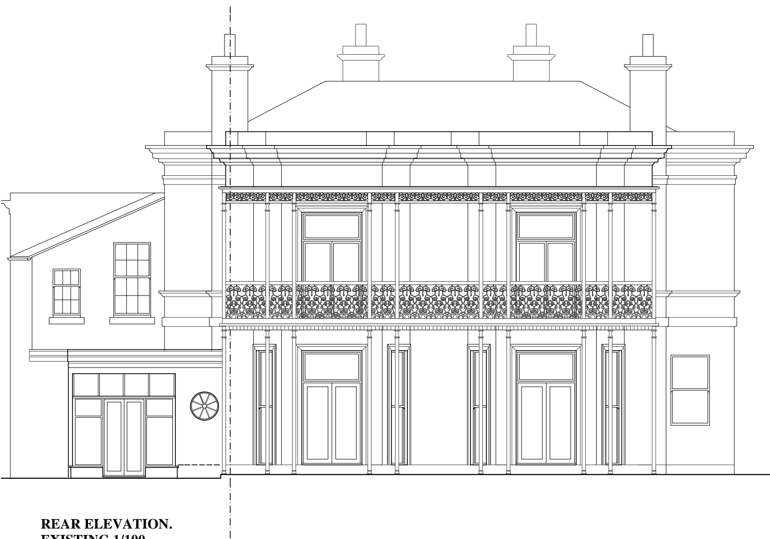
REAR ELEVATION. EXISTING 1/100