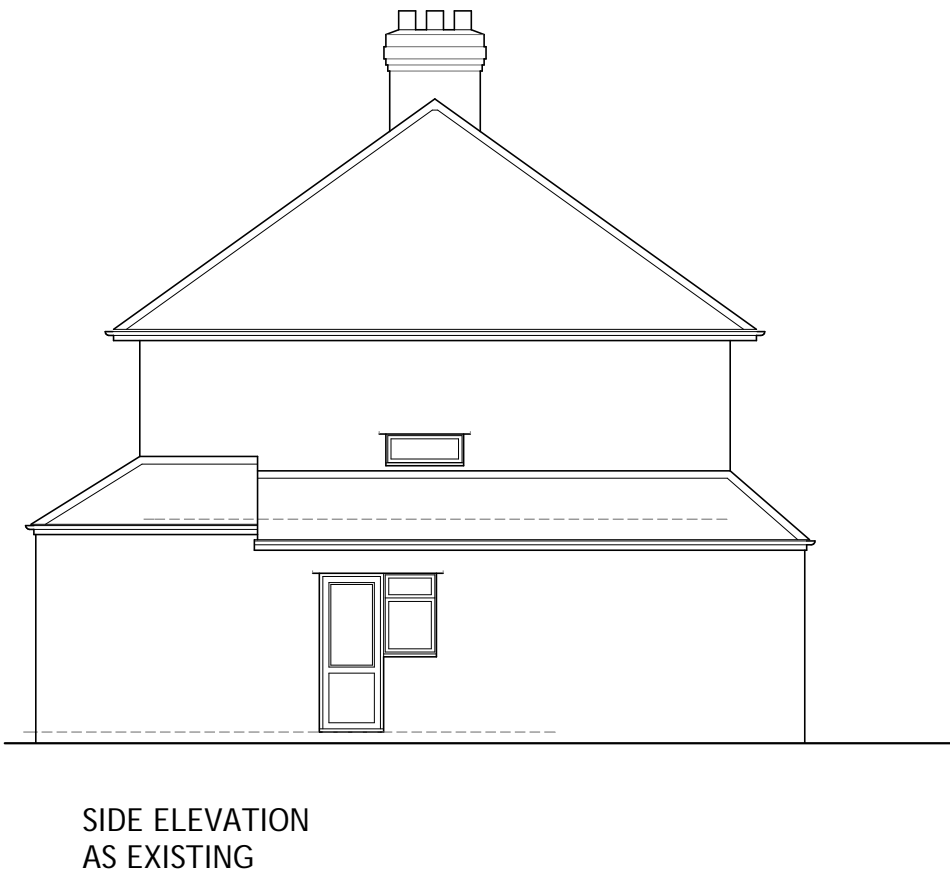
SIDE ELEVATION AS EXISTING