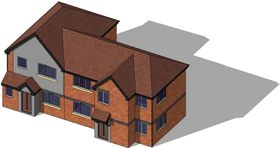
95.3m 2 /1,026ft 2 Hollyhock