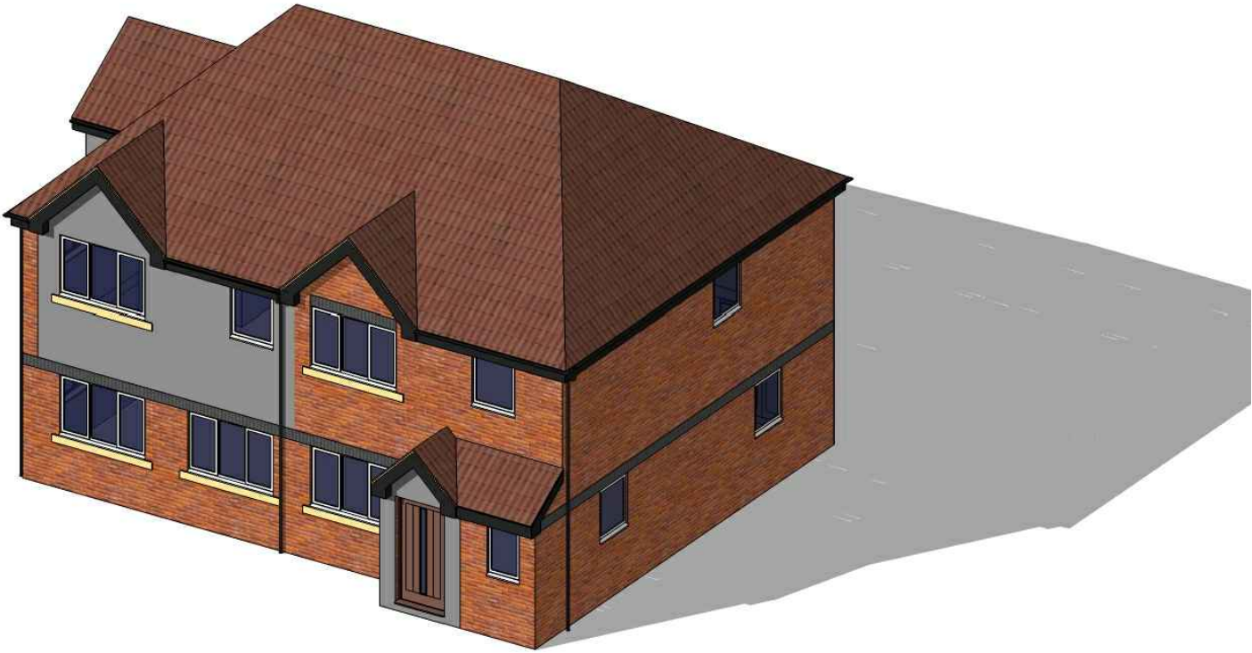
89.5m 2 /964ft 2 Charlock