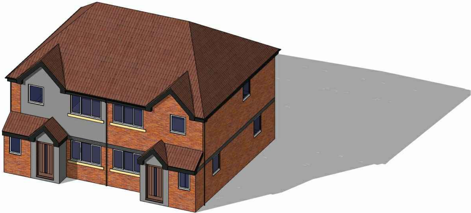
89.5m 2 /964ft 2 Charlock