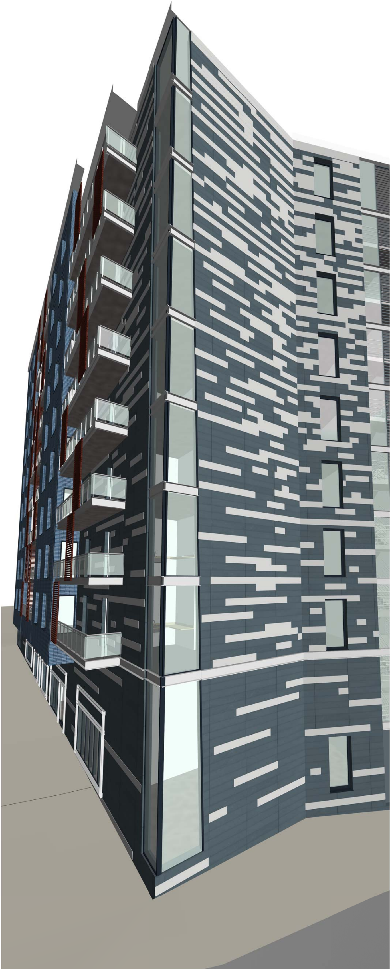
2 View 2