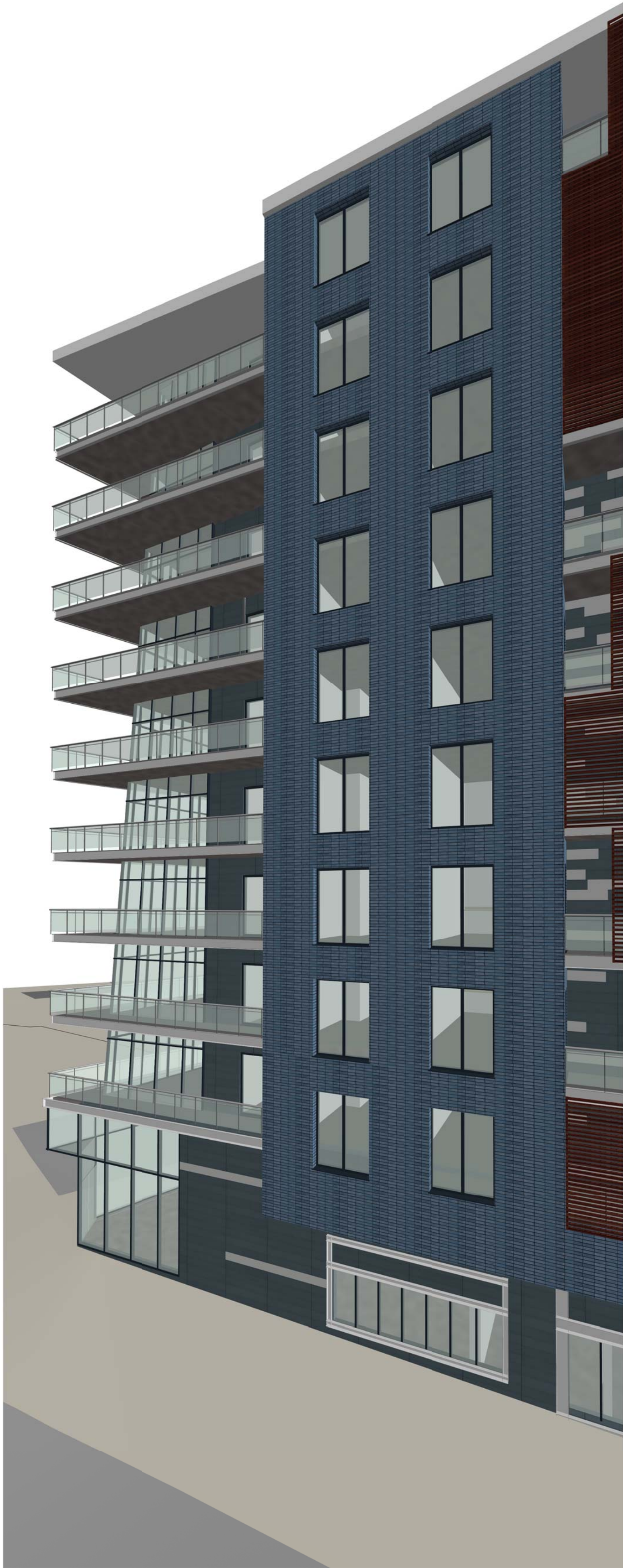
1 View 1