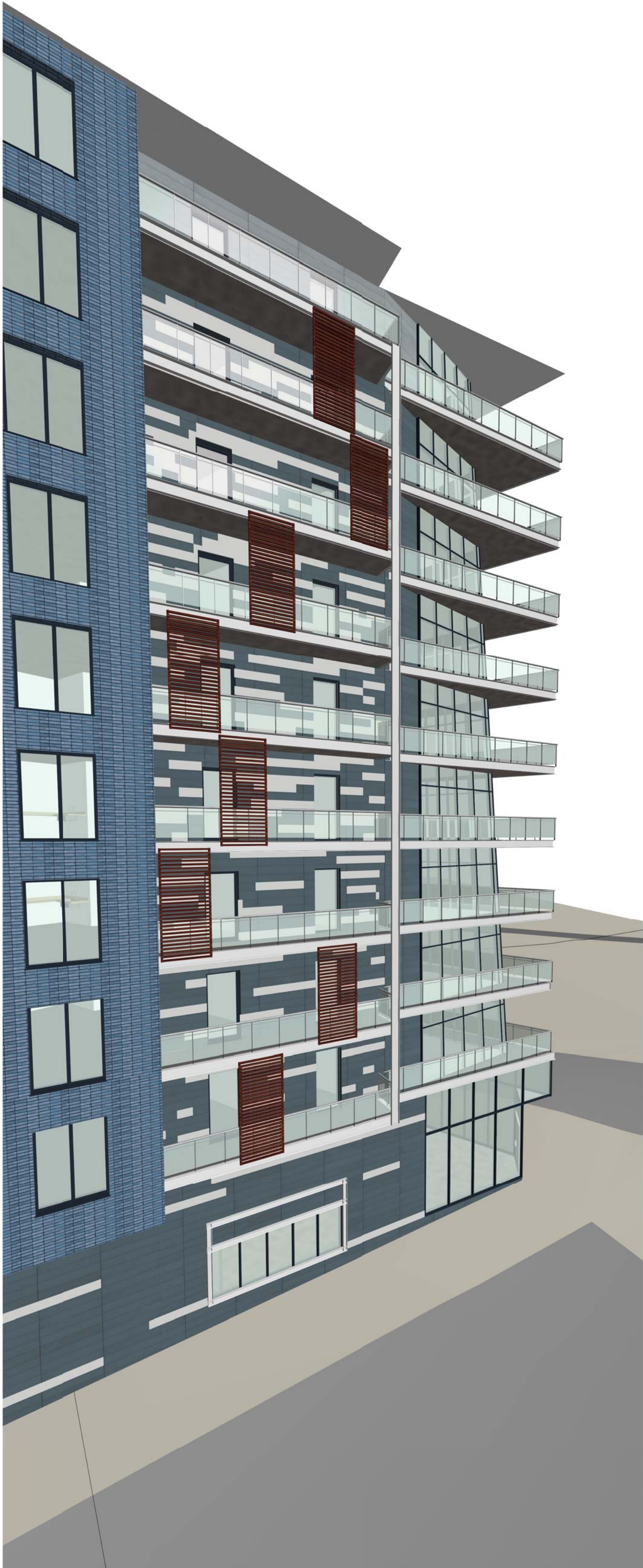
3 View 3