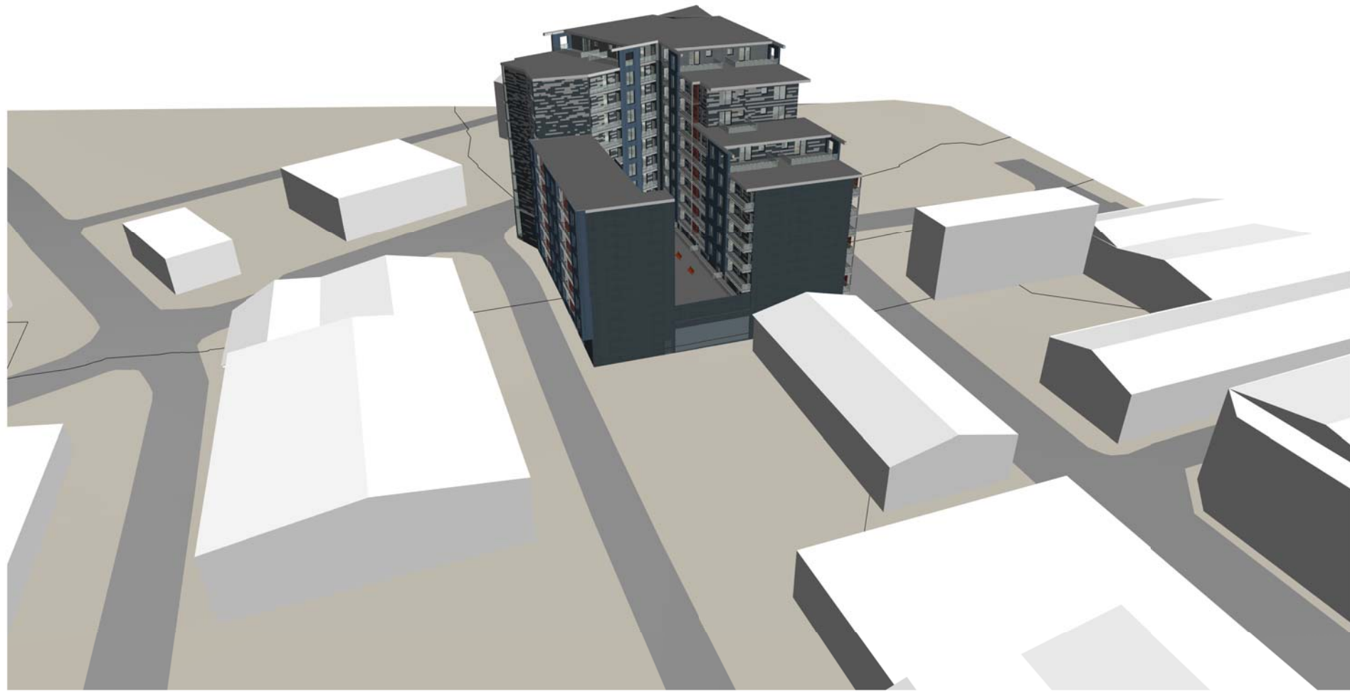
2 Aerial View - New Bird Street