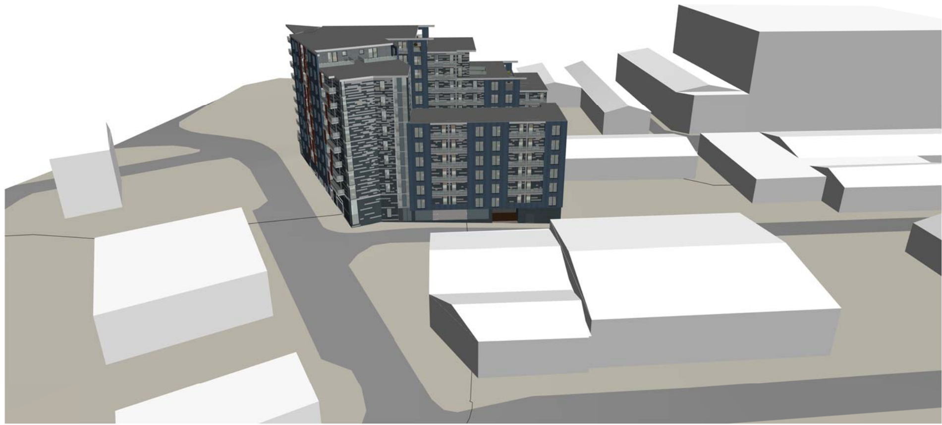
3 Aerial View - St James Street