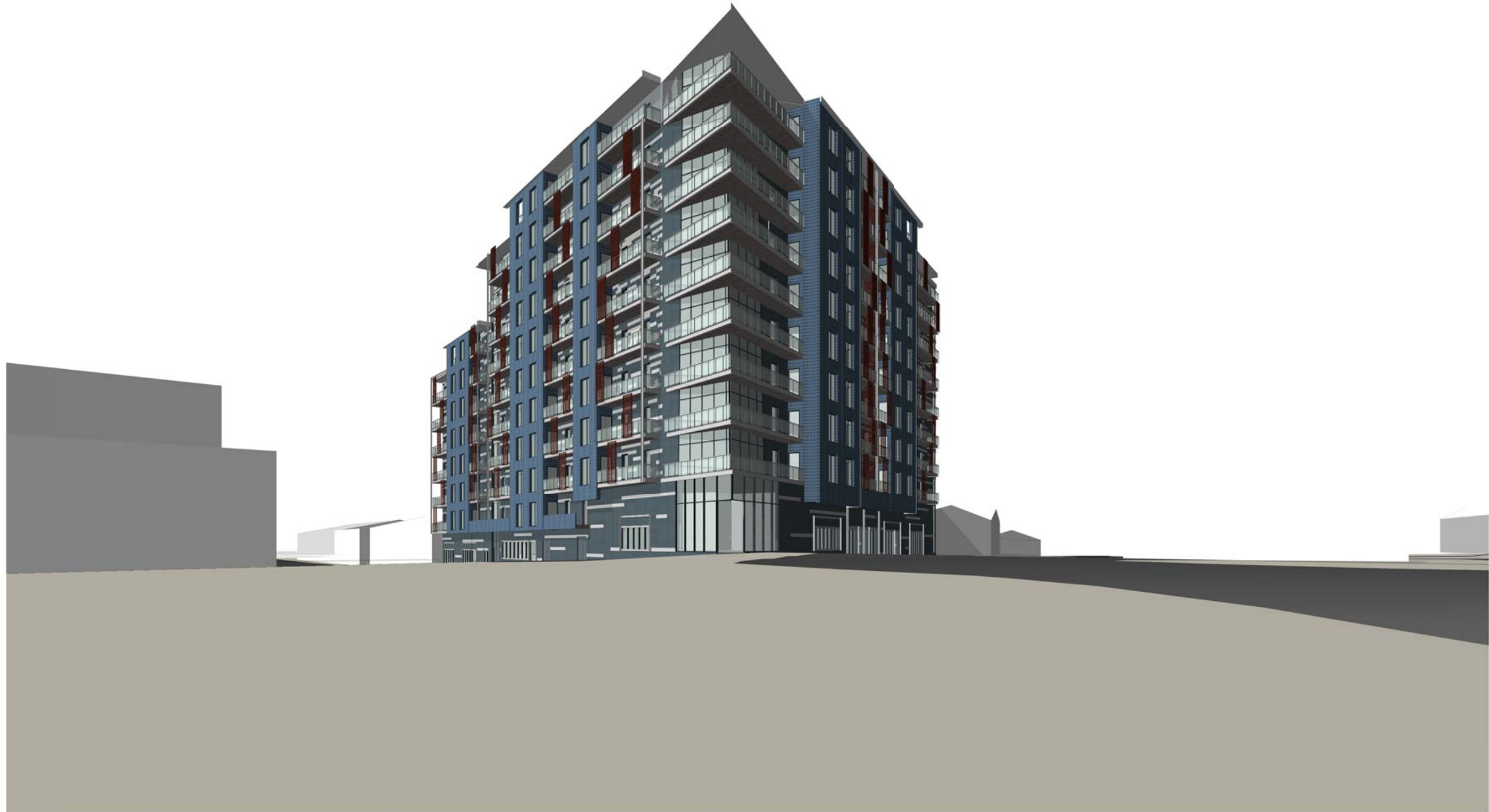
5 View - St James St Corner