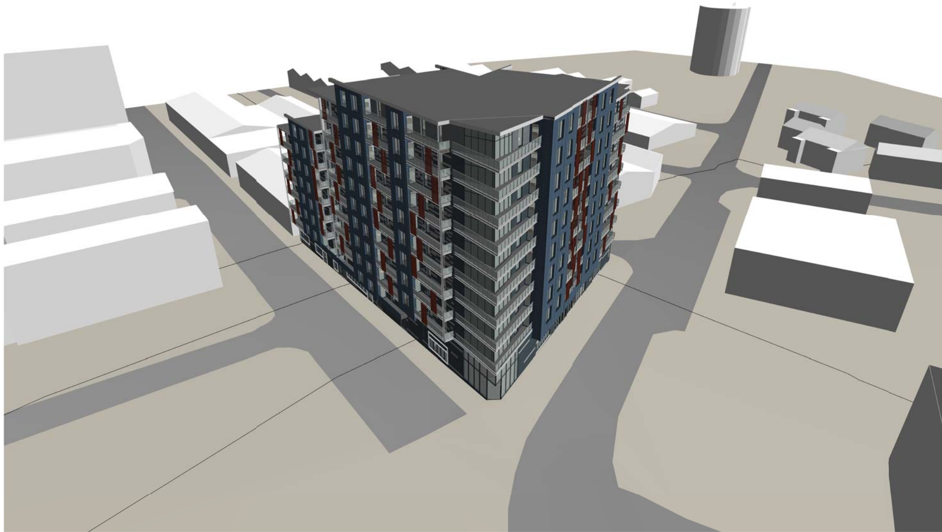
1 Aerial View - Corner of Parliament Street and Great George Street