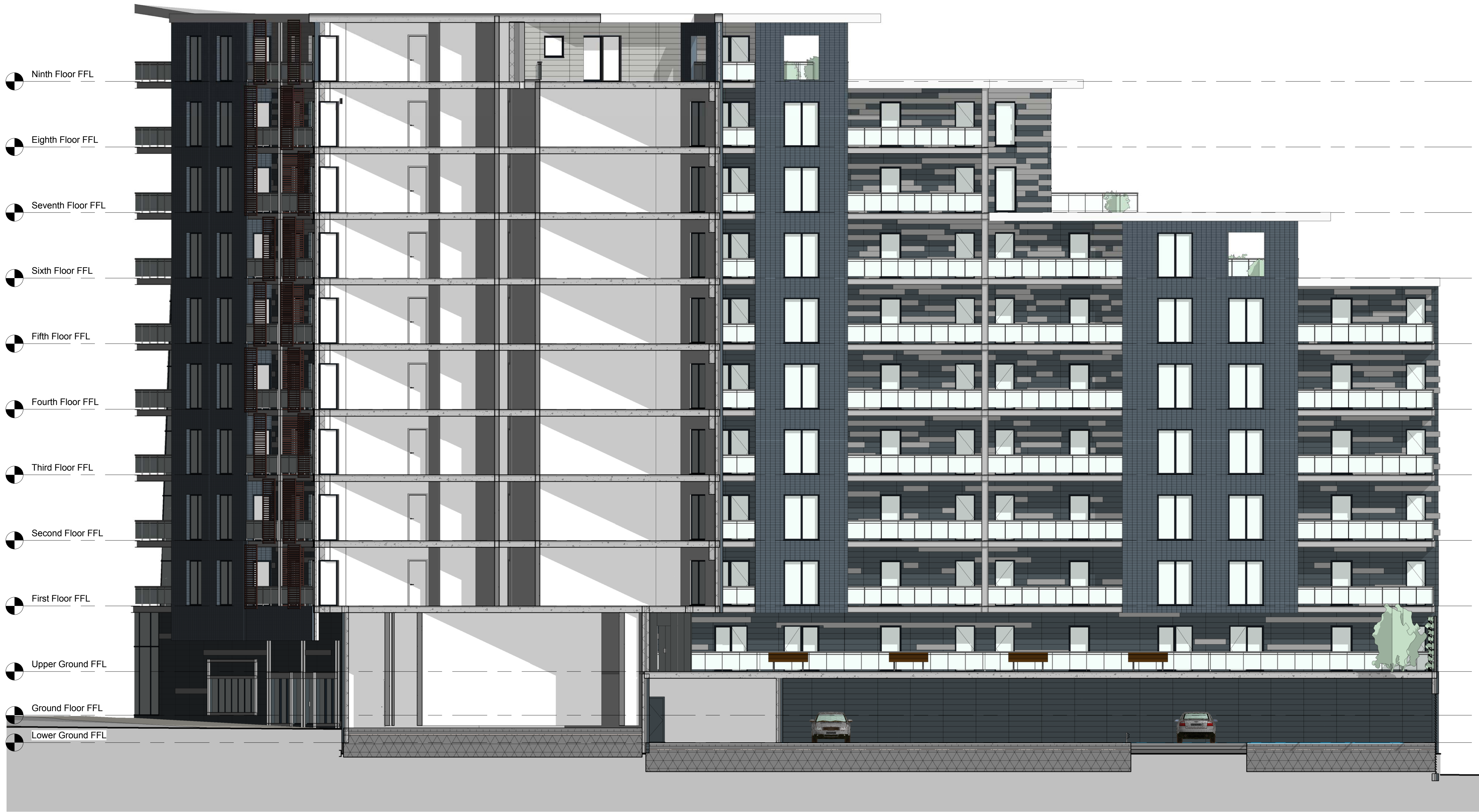
1 Proposed Section A-A 1 : 100