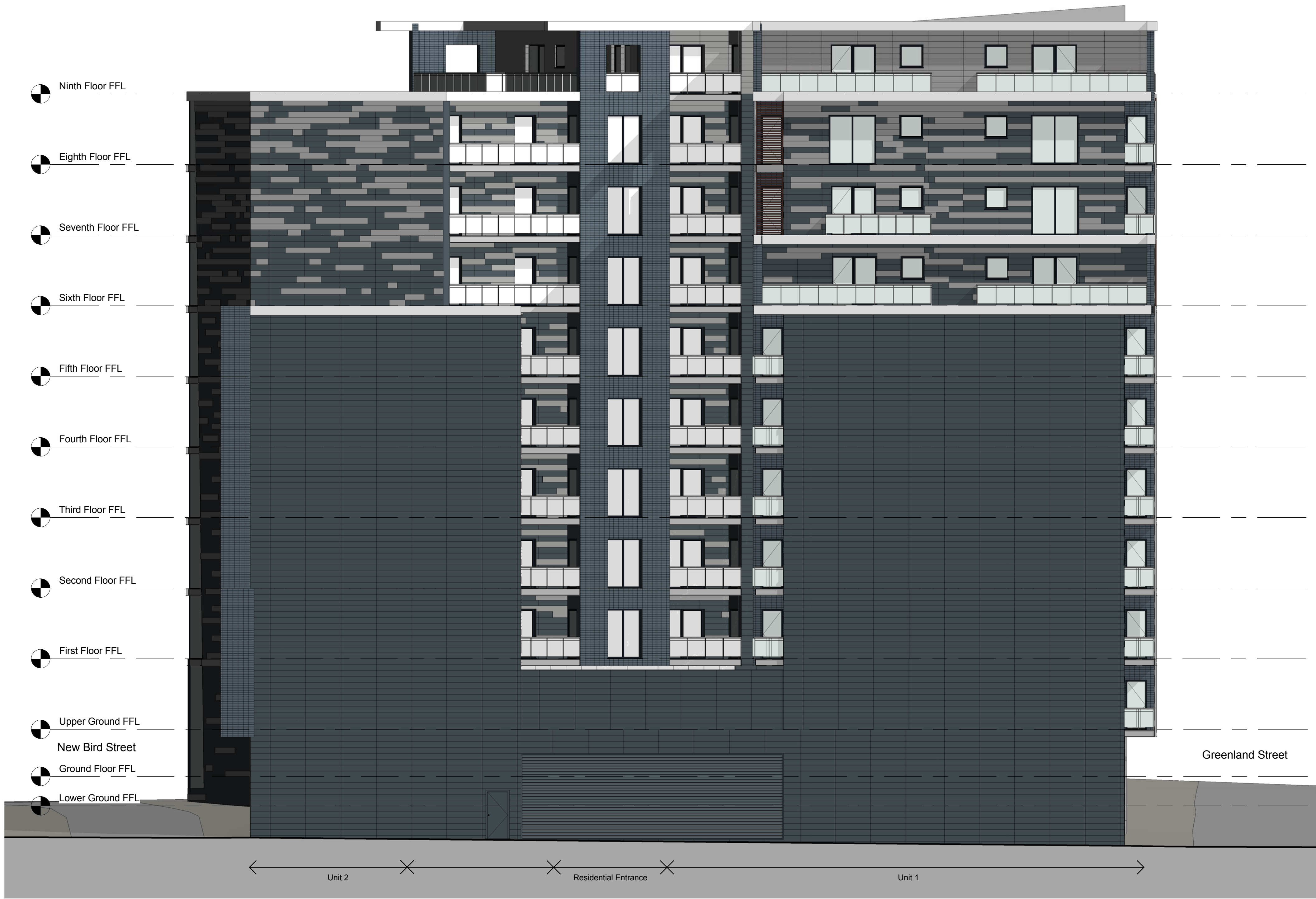
1 Proposed West Elevation 1 : 100