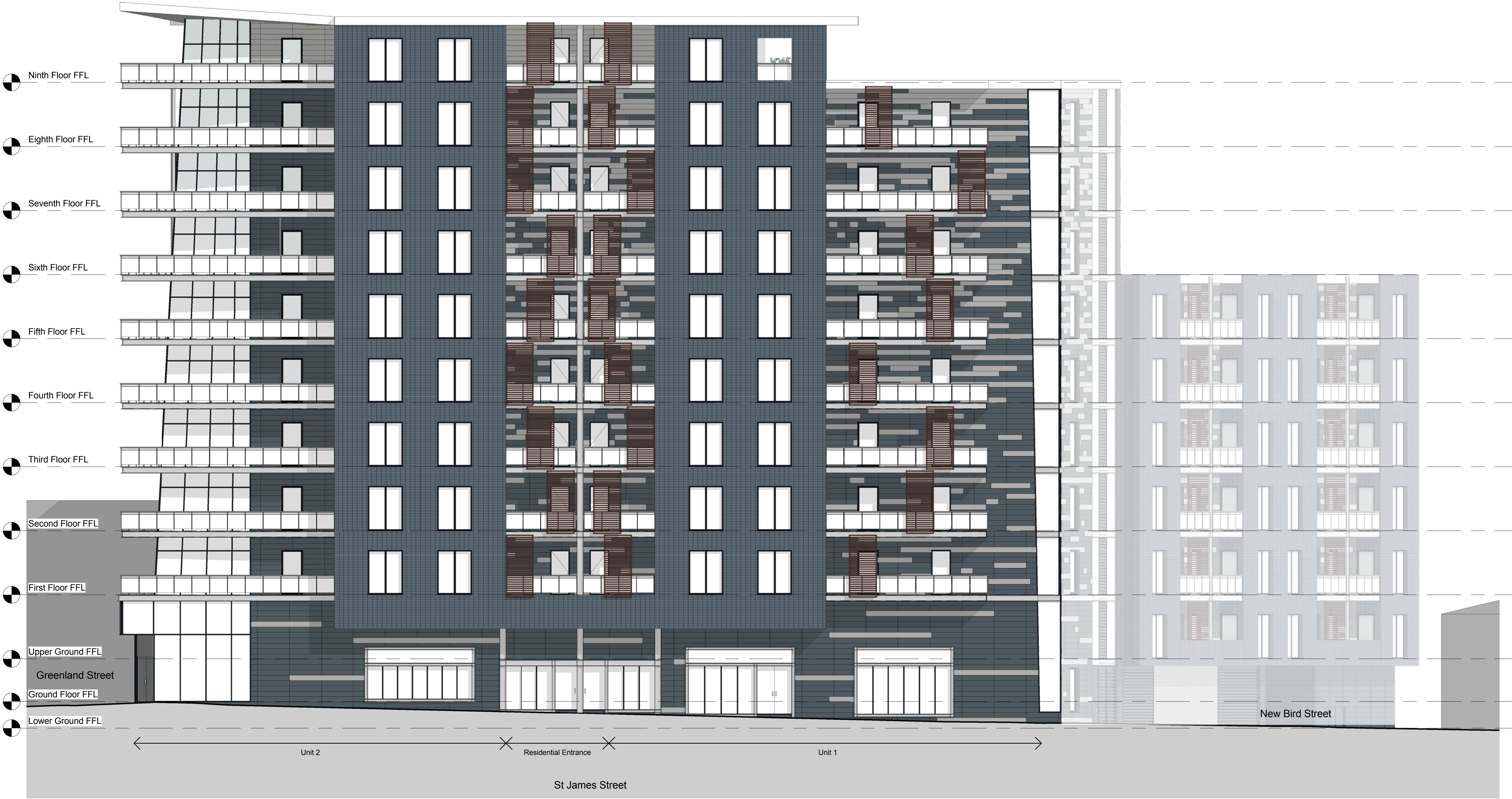
1 Proposed East Elevation 1 : 100