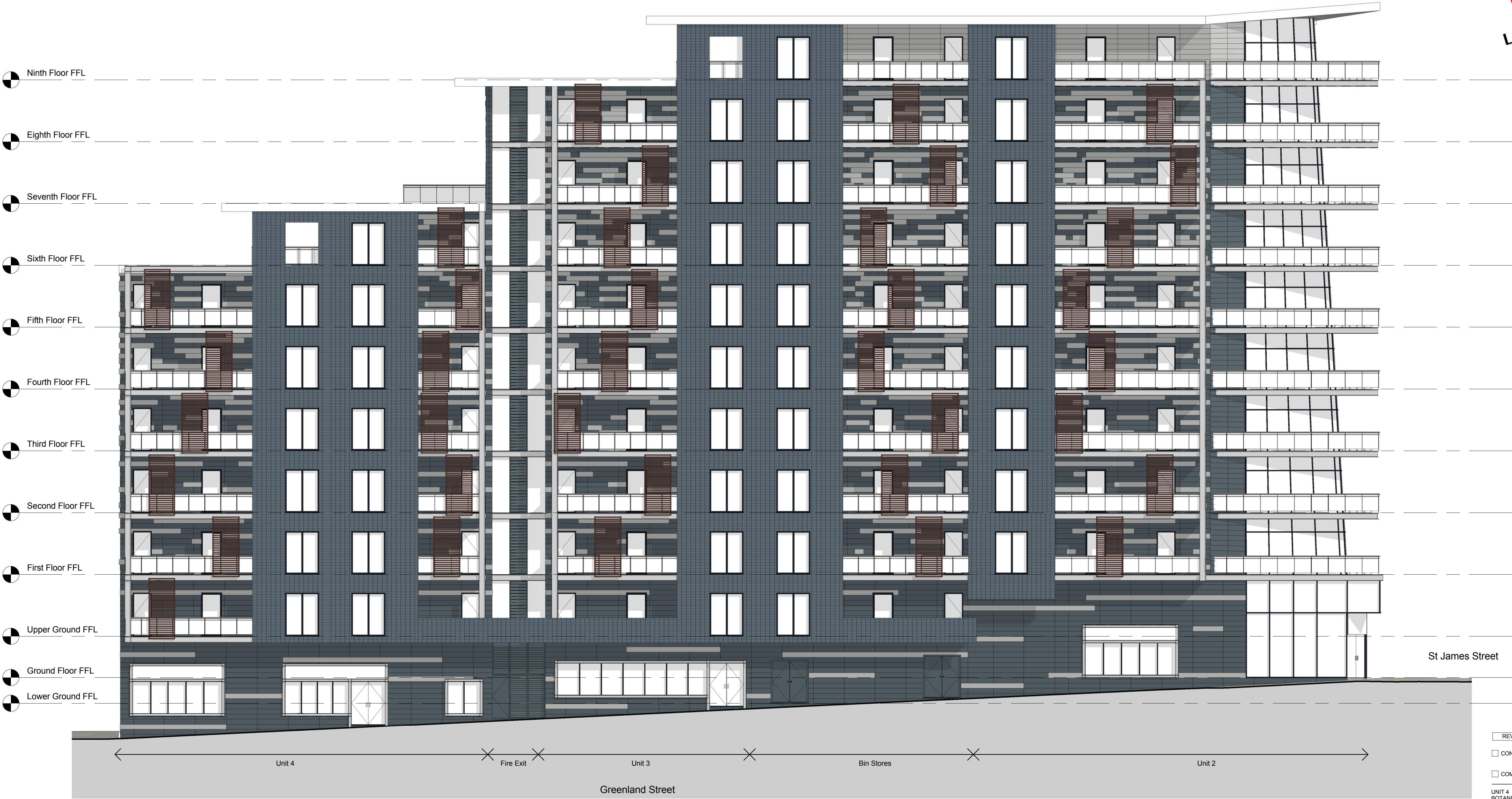
1 Proposed South Elevation 1 : 100