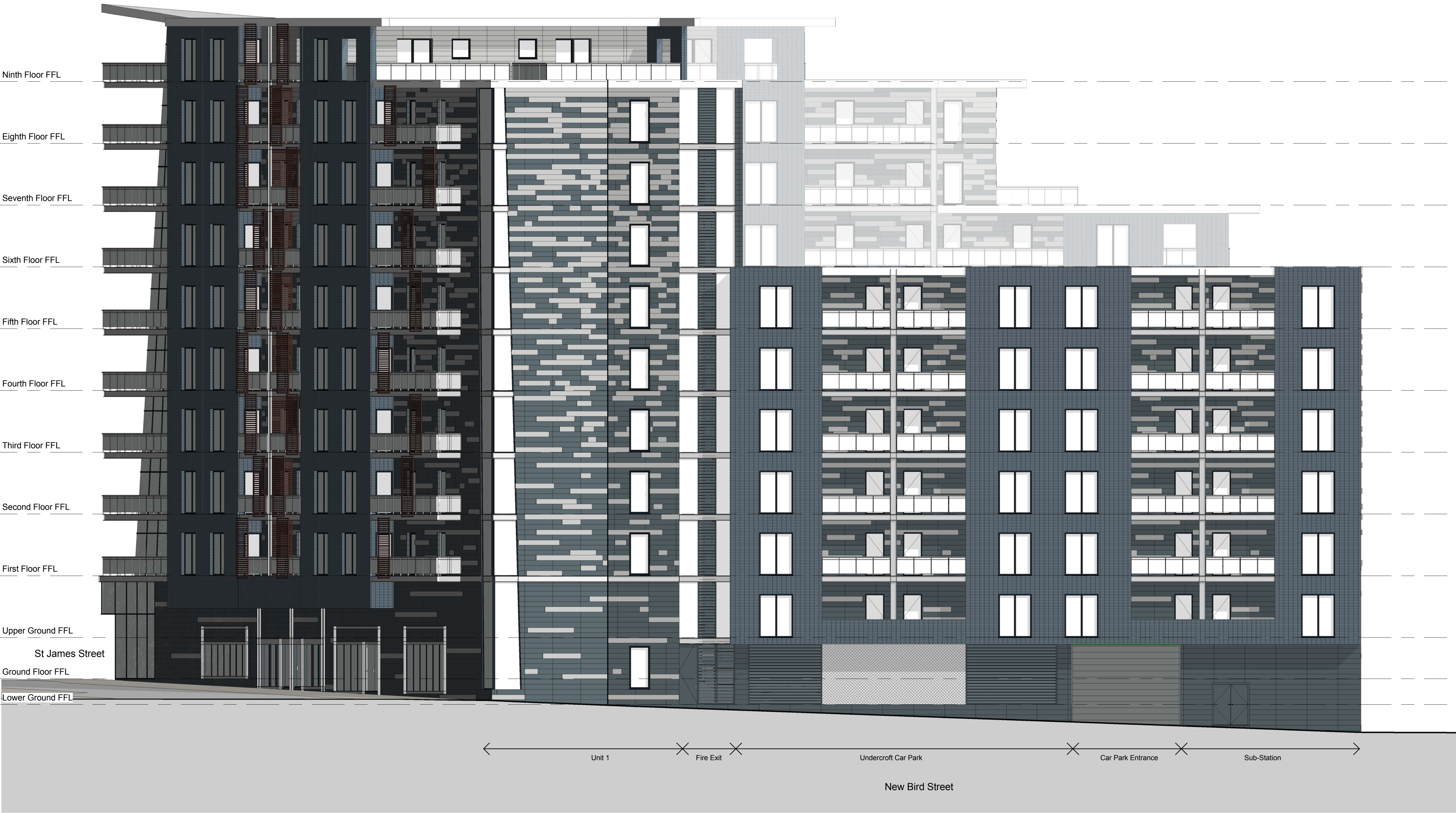
1 Proposed North Elevation 1 : 100