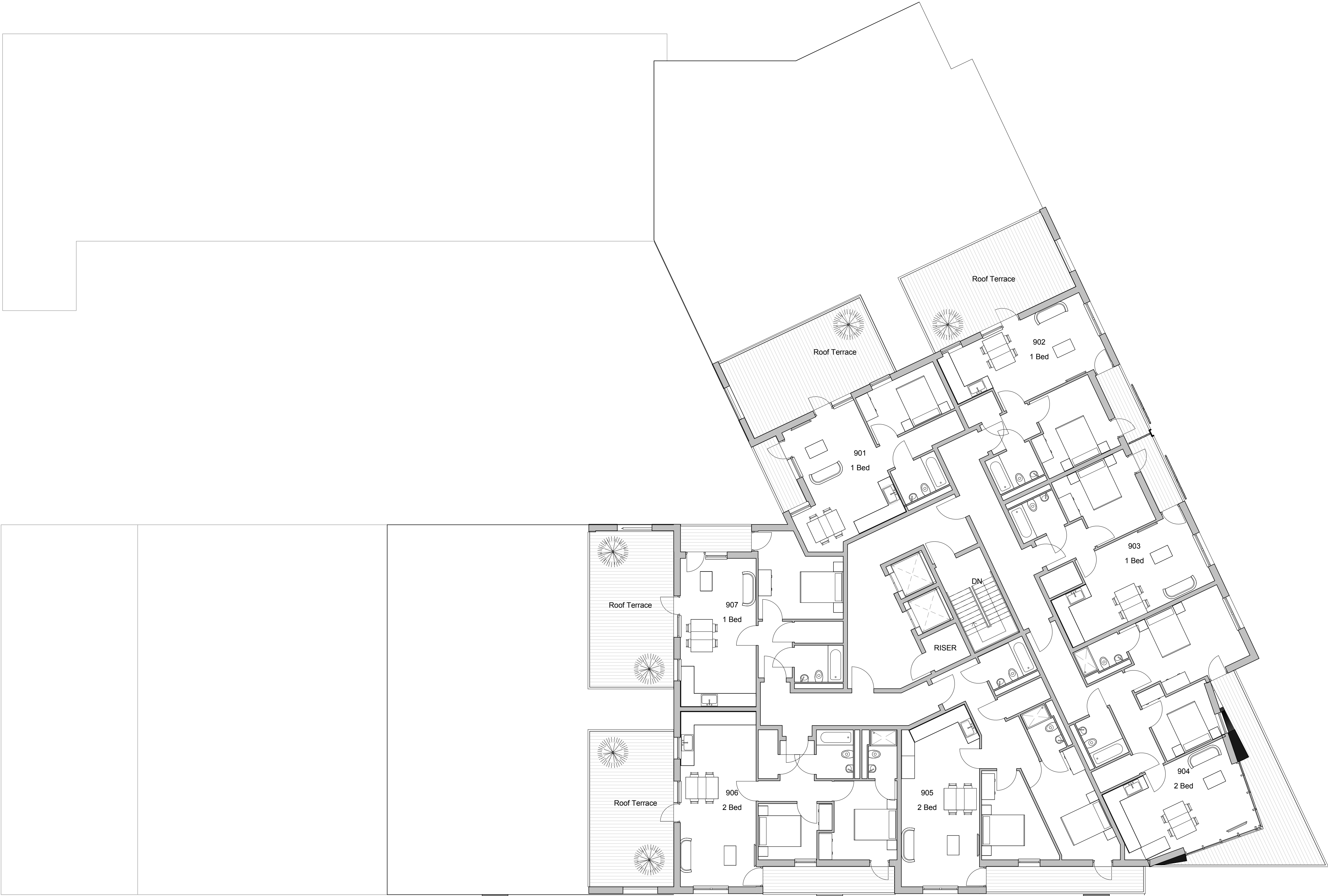
1 Ninth Floor Plan 1 : 100