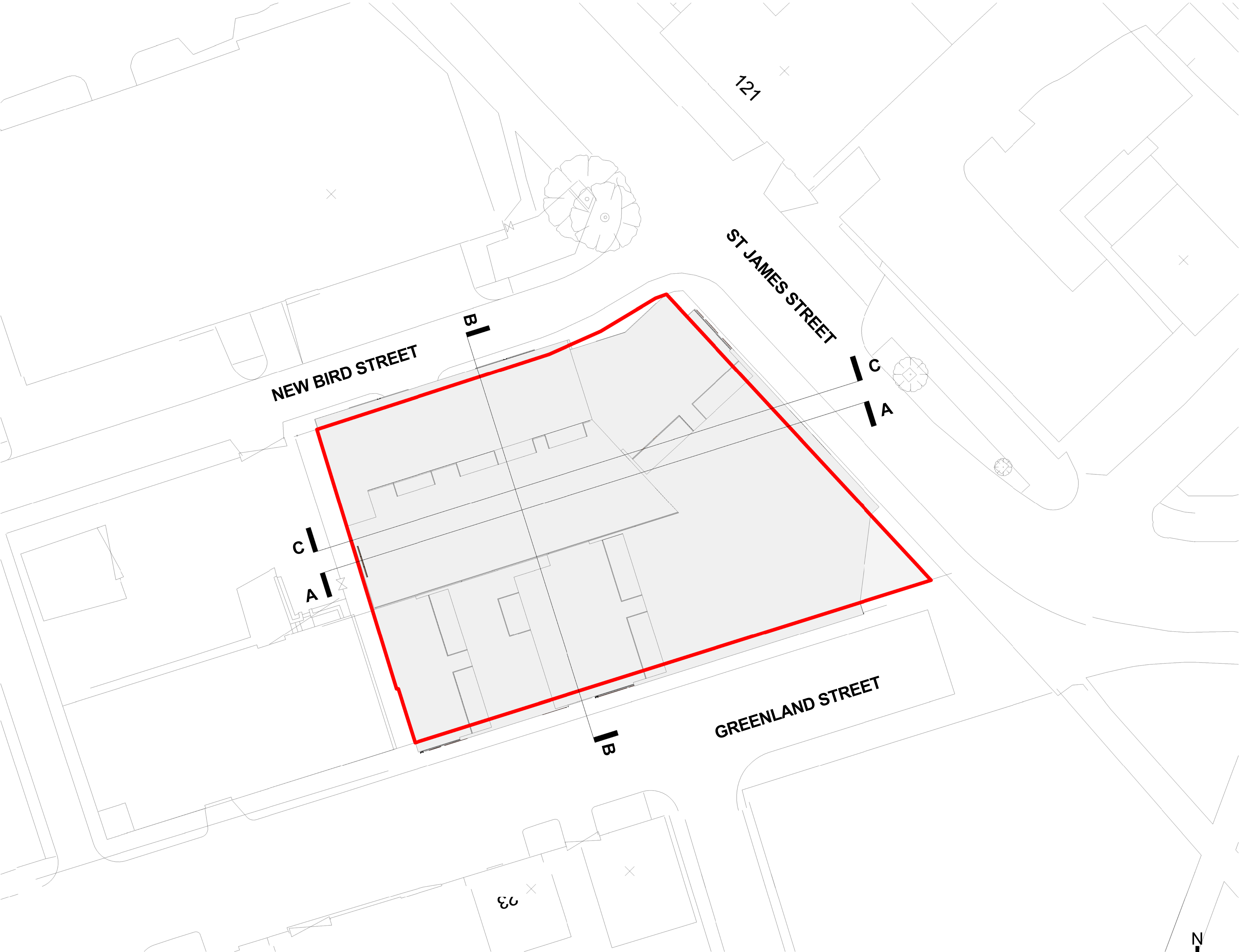
1 Proposed Block Plan 1 : 200