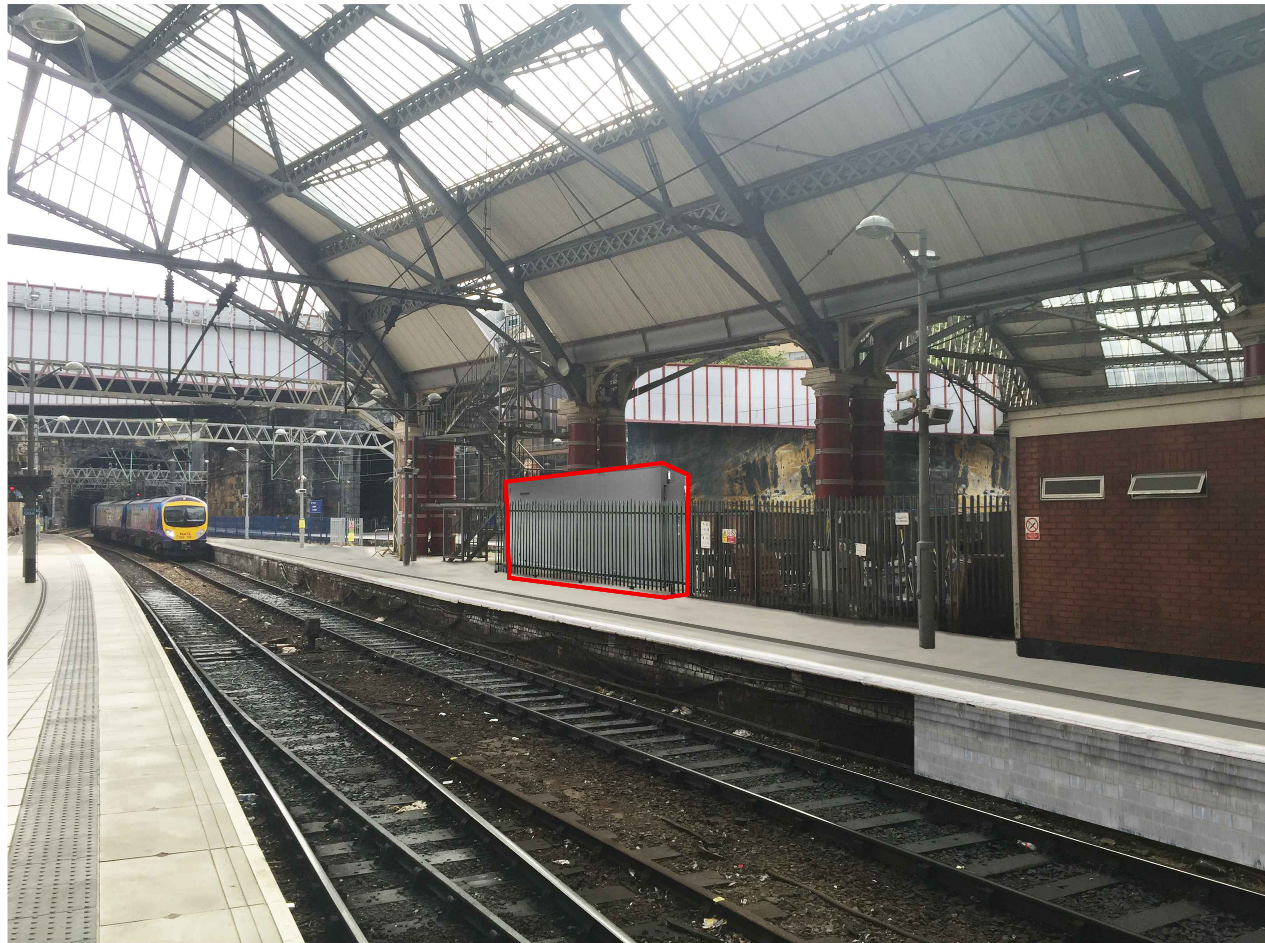
VIEW 2 PLATFORM 4 & 5 INCLUDING PROPOSED REB COMPOUND