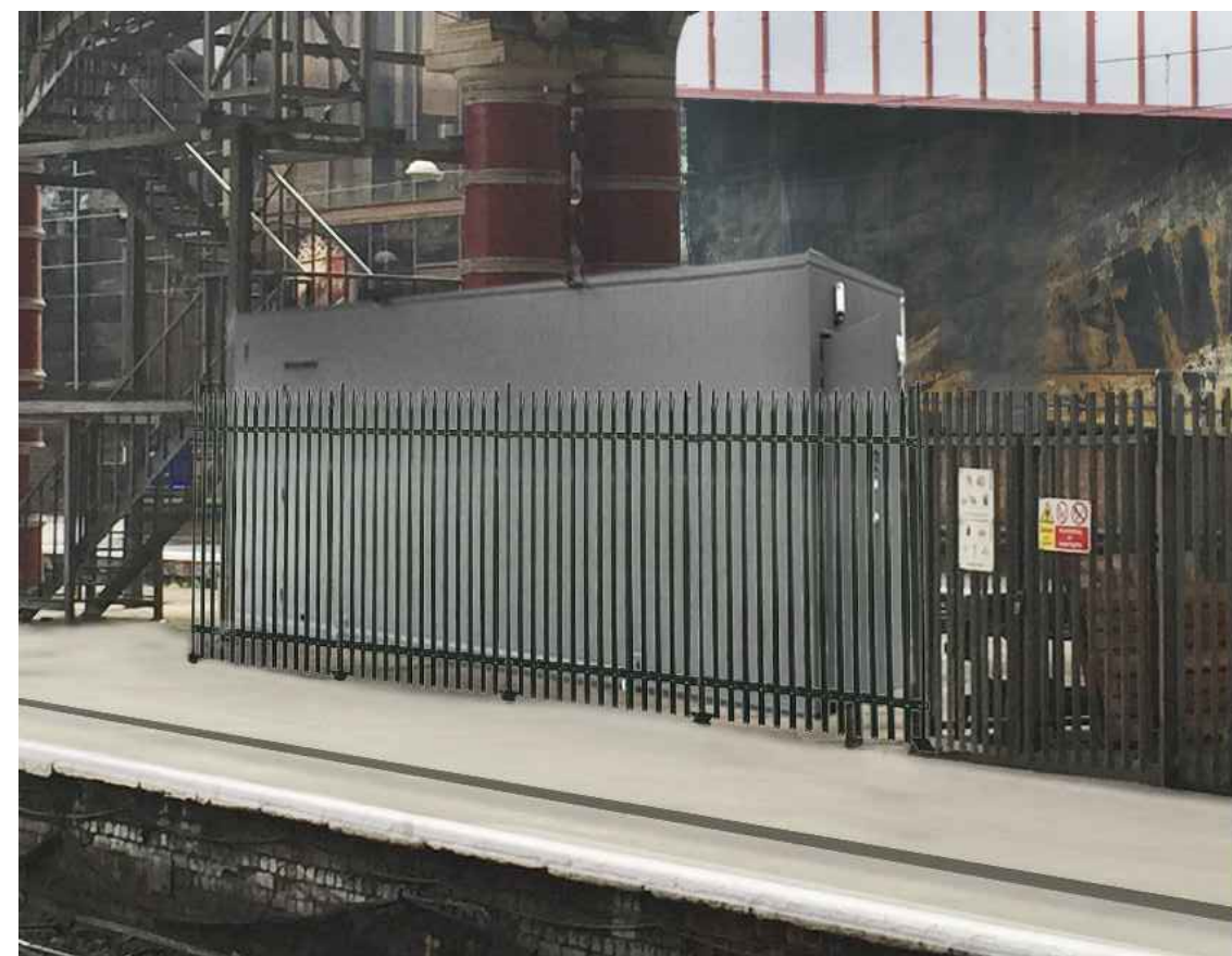
VISUAL OF REB TO BE FINISHED IN LIGHT GREY METAL EXISTING 1.8M PALISADE FENCE LINE TO BE ADJUSTED AND EXTENDED AROUND NEW REB.