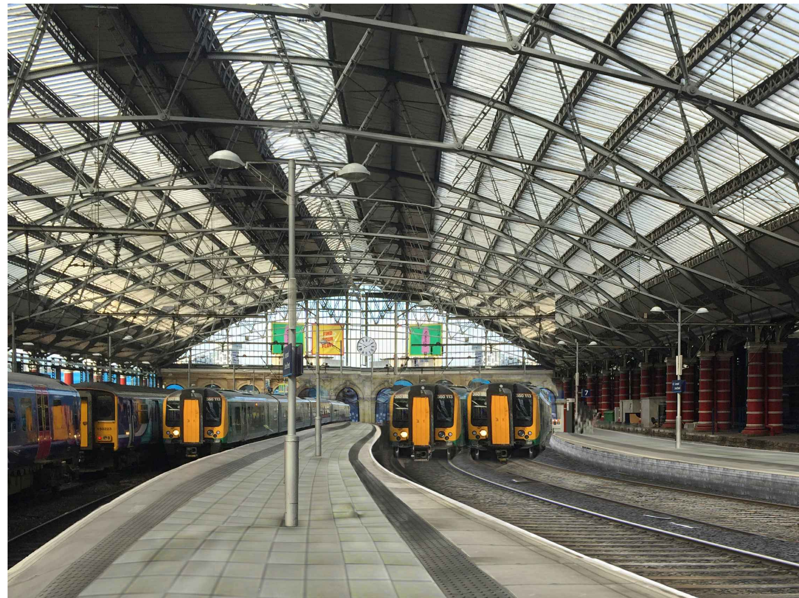
VIEW 3 - NEW PLATFORMS 6-9 TWO NEW ISLAND PLATFORMS FROM EXISTING WIDER PLATFORM