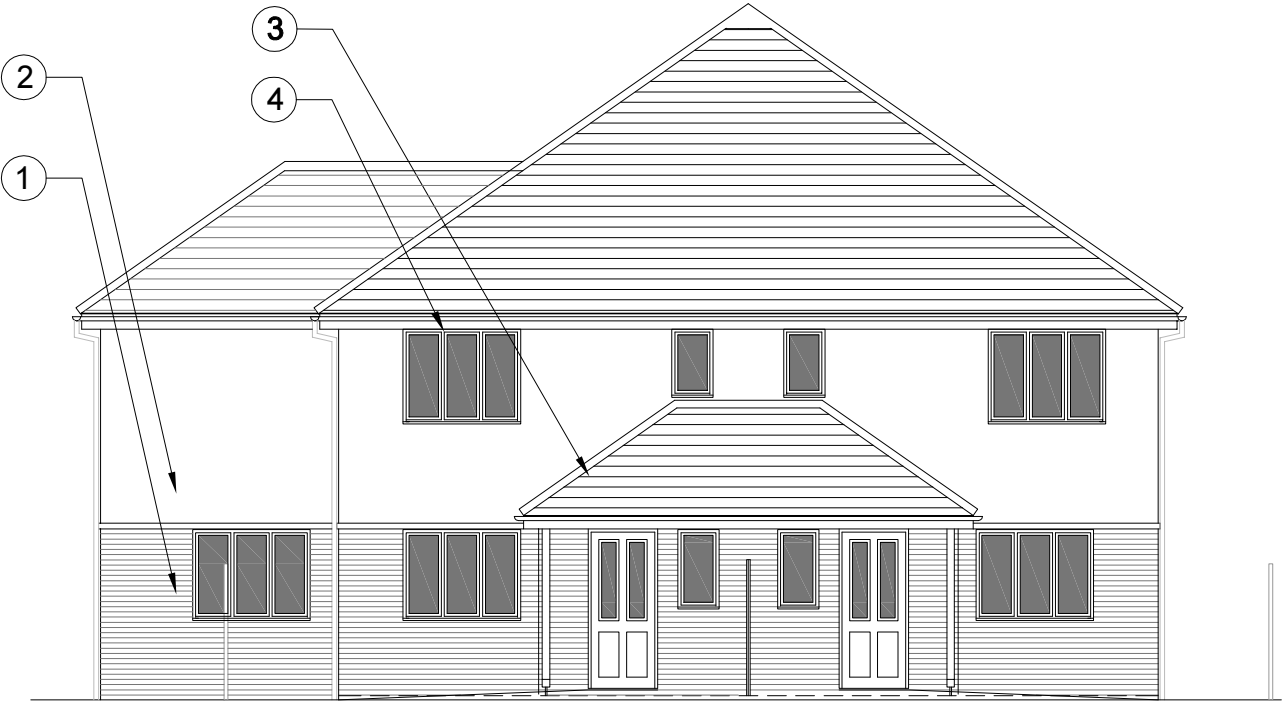
House 2 House 1