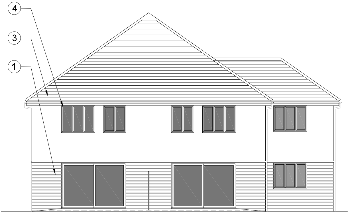
House 1 House 2