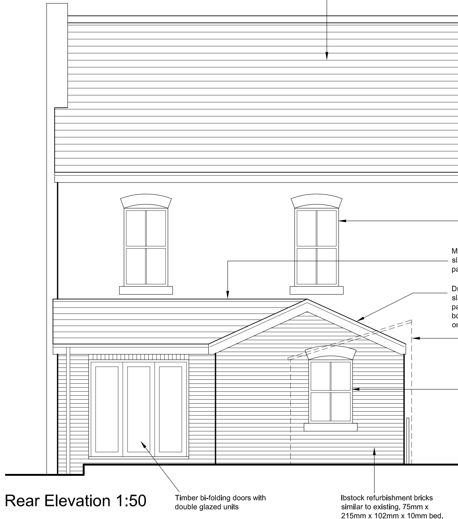
Rear Elevation 1:50

Dual pitched main roof with slate finish