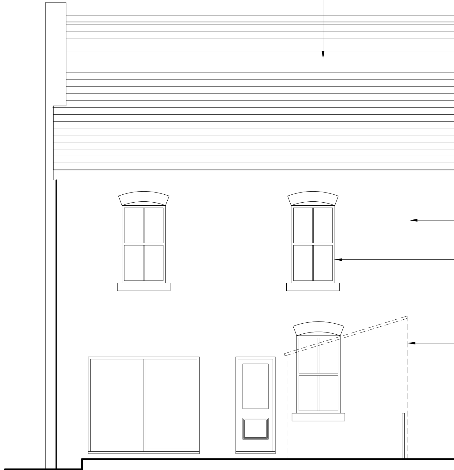
Rear Elevation 1:50

Dual pitched main roof with slate finish