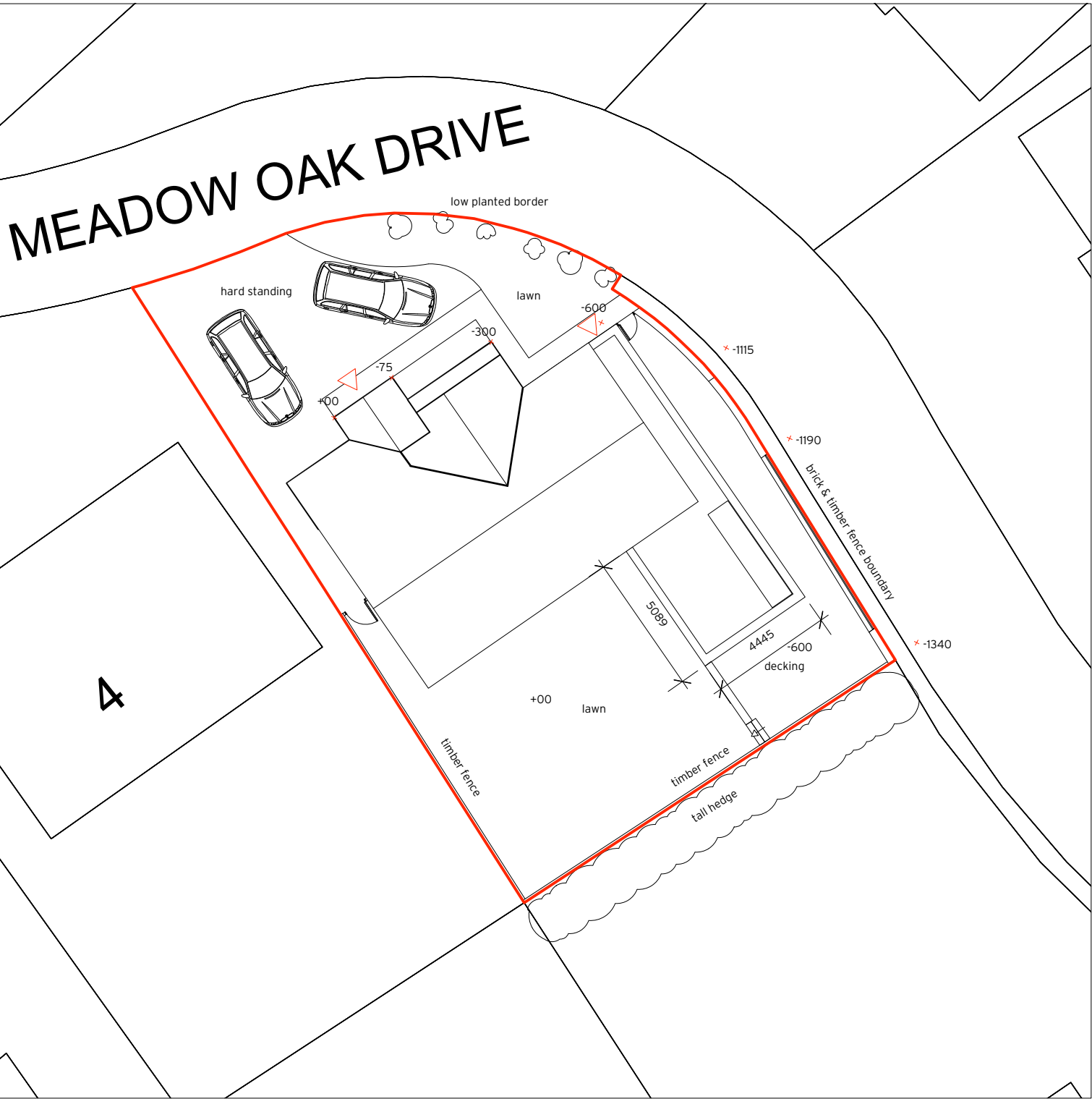
PROPOSED SITE PLAN / BLOCK PLAN SHOWING ROOF 1:200