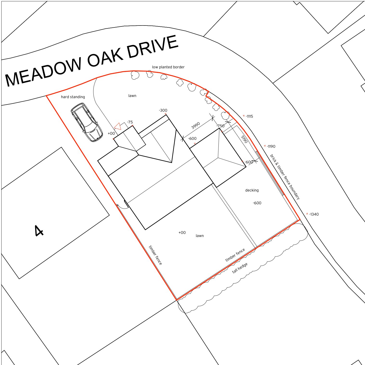
EXISTING SITE PLAN / BLOCK PLAN SHOWING ROOF 1:200