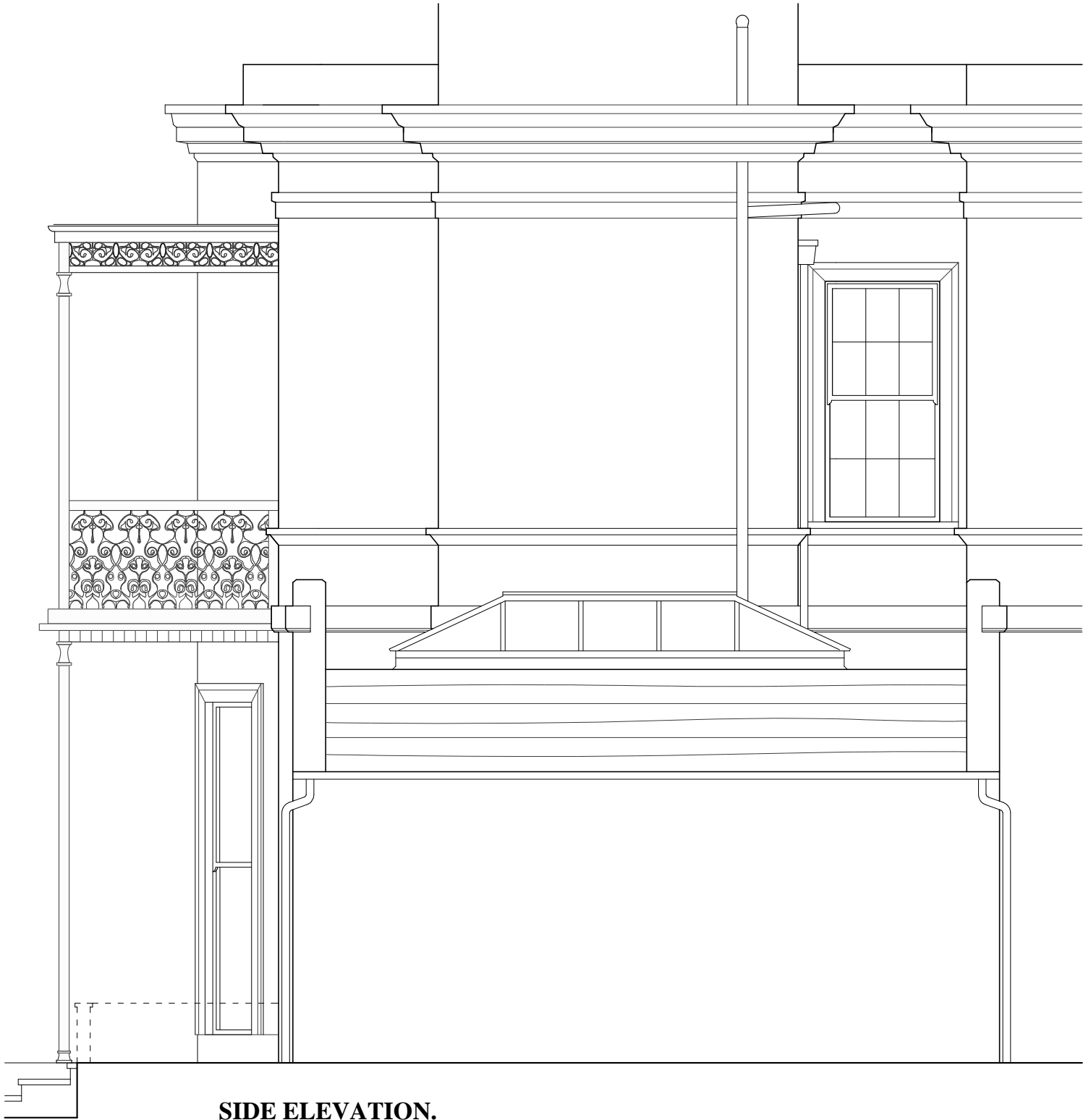
SIDE ELEVATION. PROPOSED 1/50

EXTERNAL WALL FACING. Lime based render with exterior quality mineral based paint finish - colour(s) to match existing. DRESSINGS - STRING COURSE & DOOR SURROUNDS. Cast stone - profiles to match existing, with exterior quality mineral based paint finish - colour(s) to match existing. EXTERNAL DOORS & GLAZED SIDE PANELS. Double glazed, timber framed - profiles to match existing. Paint finish colour(s) to match existing. ROOF LANTERN. Double glazed timber framed. Paint finish colour(s) to match existing windows. PITCHED ROOF. Re-claimed Welsh Slate. RAINWATER GOODS. Cast iron. Paint finish colour(s) to match existing.