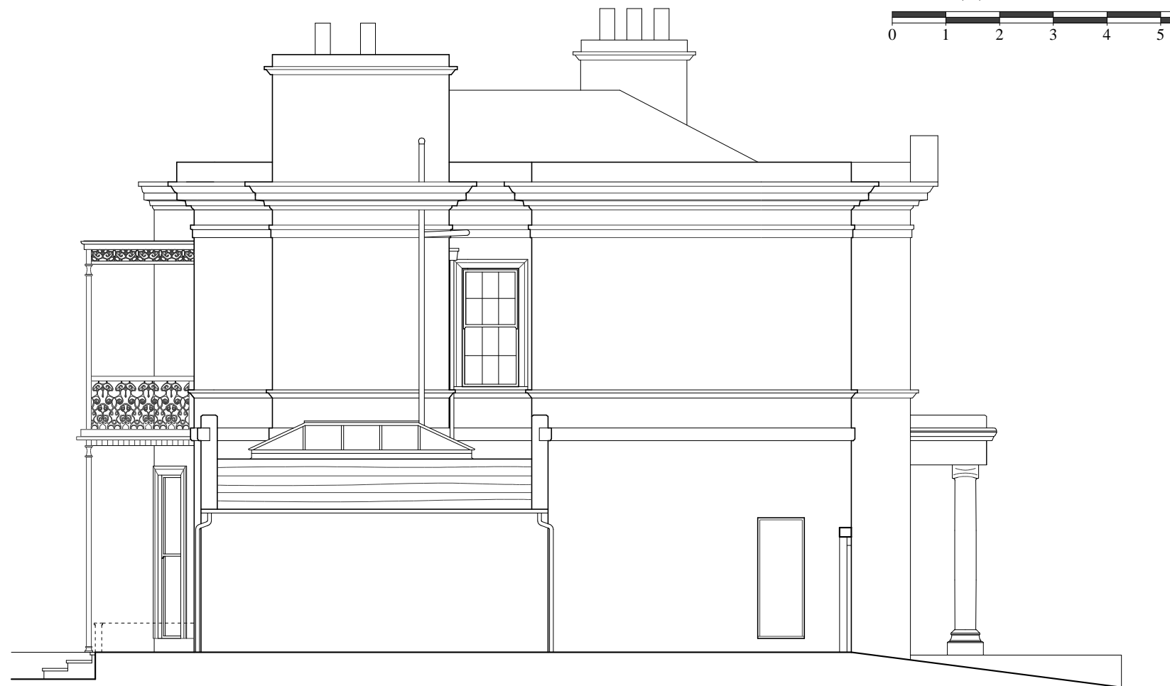
SIDE ELEVATION. PROPOSED 1/100