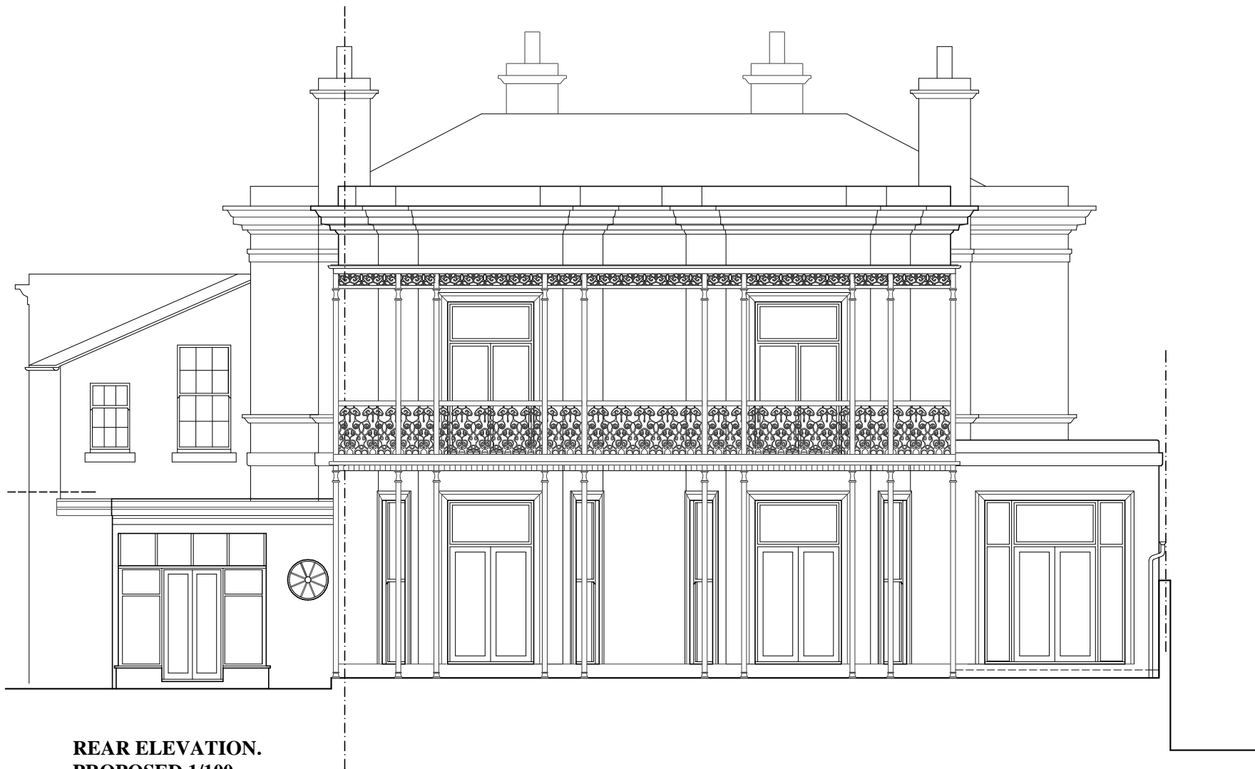
REAR ELEVATION. PROPOSED 1/100