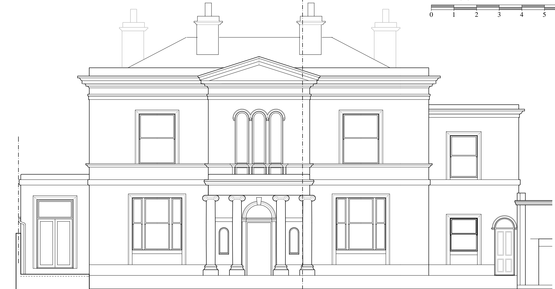
FRONT ELEVATION. PROPOSED 1/100