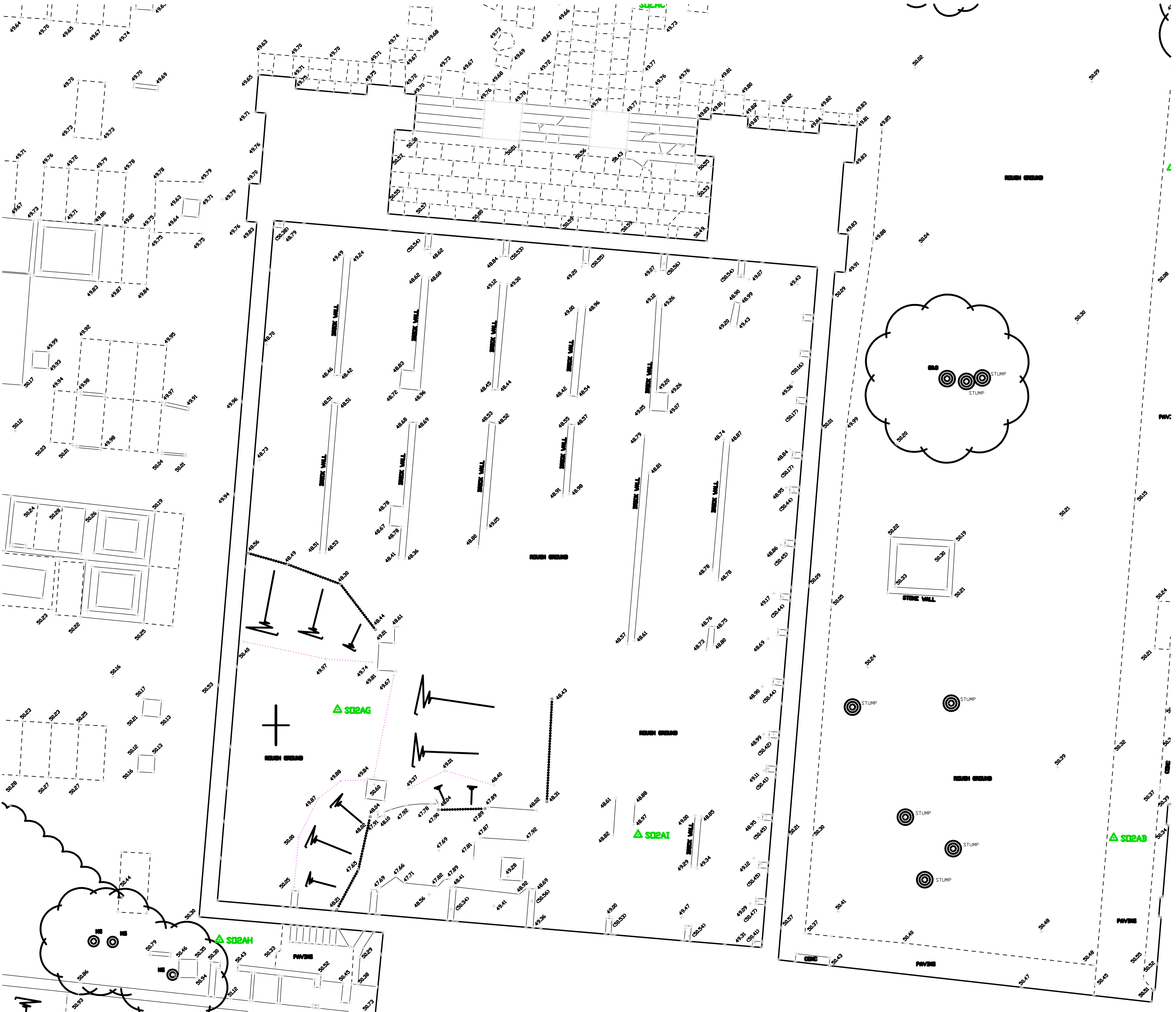
Existing Ground Floor Plan