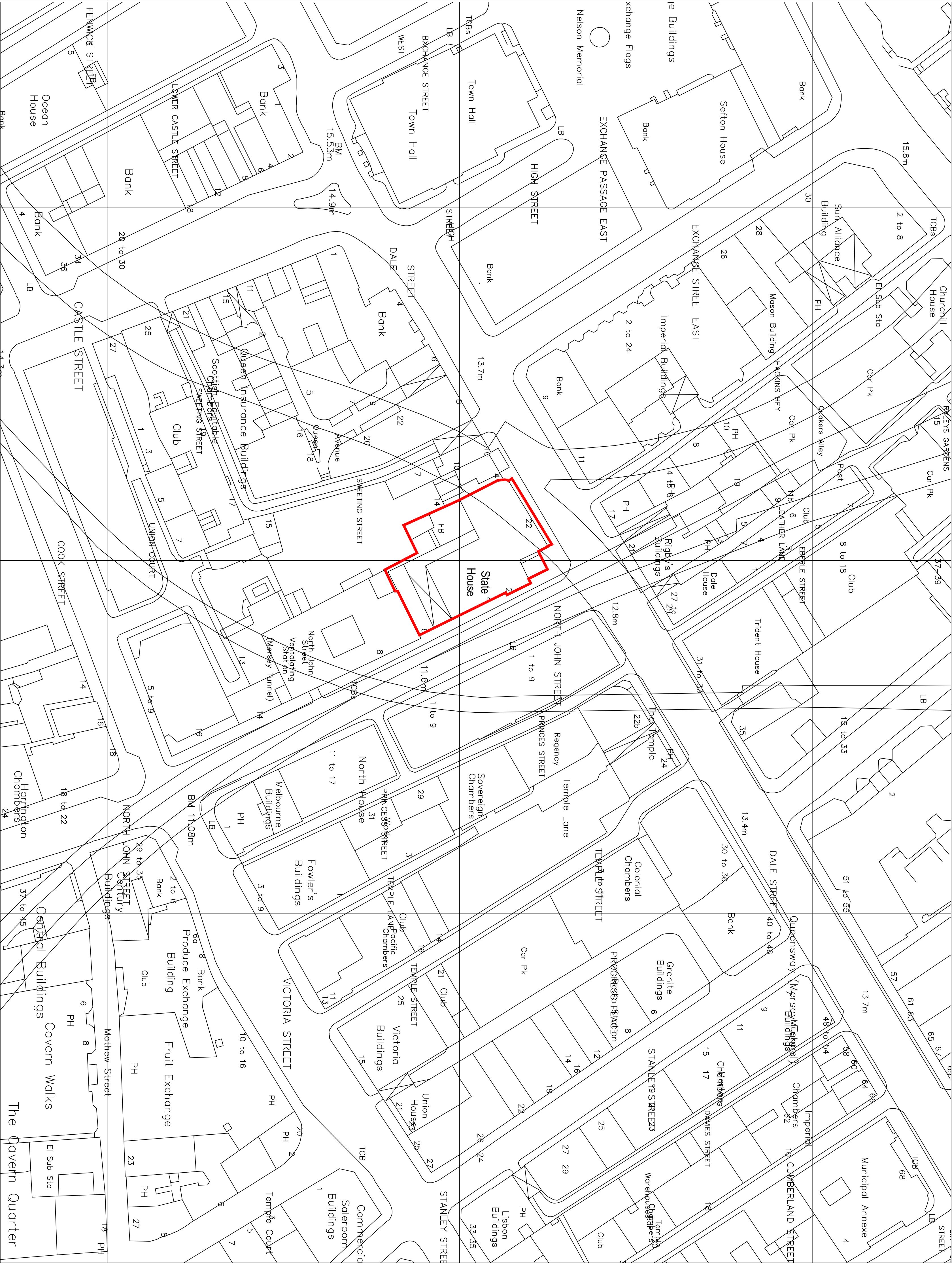
Site Location Plan 1:1250