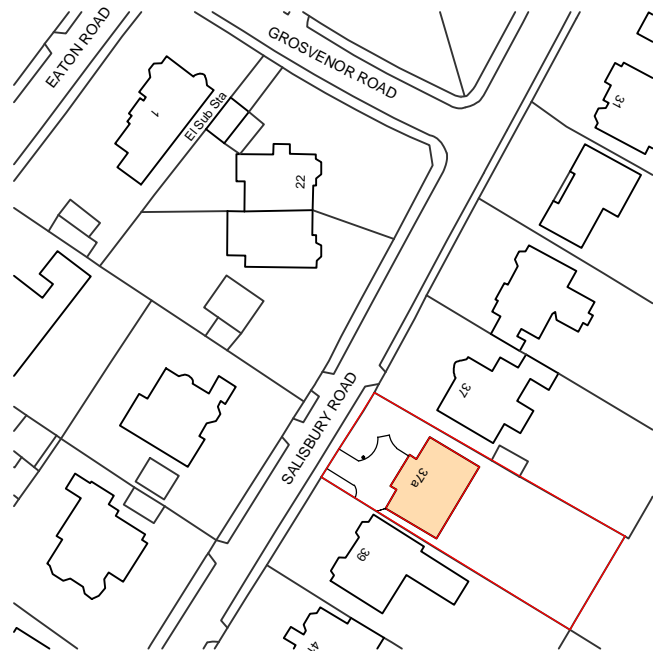
Location Plan 1:500

This drawing is to be read in conjunction with all other issued drawings and specifications. All dimensions must be verified on site by the contractor before commencing work. Do not scale off this drawing. Refer to written dimensions only. All dimensions in millimetres unless otherwise stated.